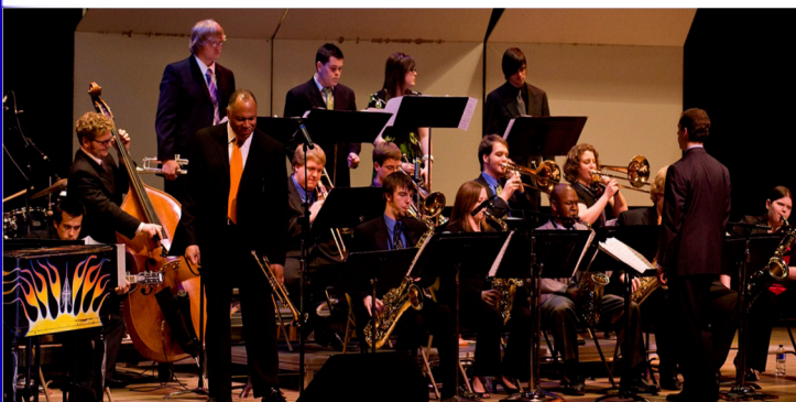
40th Annual SWOSU Jazz Festival