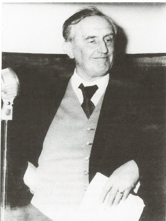
Figure 7. Tolkien giving his speech.

“Is there really no deeper meaning in The Lord of the Rings ?”, asked Lambers.