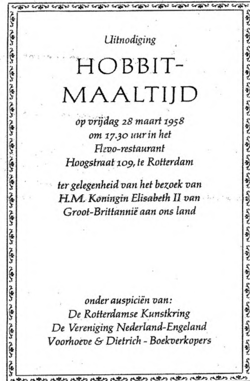
Figure 2. The invitation to the "Hobbit dinner". Photograph by and © the Royal Library, The Hague.

Publicity was also gained by the glossy invitations (as four-page leaflets) Het Spectrum had printed and which Voorhoeve & Dietrich distributed amongst their regular customers. It contained the program of the evening, the menu, the text of the press-release (but this time in Dutch) and proudly stated on the cover that on the occasion of the visit by H.M. Queen Elizabeth II of Great-Britain a Hobbit dinner ("Hobbit-maaltijd" in Dutch) would take place on Friday, 28 March 1958, from 17.30 hours onwards at the Flevo-restaurant in Rotterdam. In fact the Flevo-restaurant was not a restaurant at all; the Flevo-hall was part of the "Twaalf Provinciën Huis", a multi-functional building. The hall was also used for concerts, exhibitions and even as a cinema. Nobody I spoke to liked the hall, for it was barren, without style or attractiveness, and had no windows. Because it was not a restaurant, they had to use outside caterers. Printed in the invitation leaflet was also the list of the "Ere-Comité", the Committee of Honour. To give more standing to the visit and to get more publicity Voorhoeve & Dietrich and Het Spectrum established a committee of honour. Moreover, protocol demands that there be such a committee. With all its connections in Rotterdam high society, it was no wonder that Voorhoeve & Dietrich could find a number of people of substance to take a place in this committee: the burgomaster of Rotterdam, the alderman responsible for