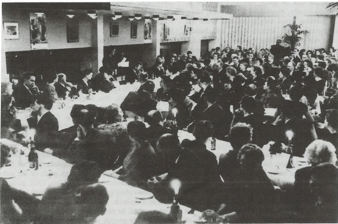
Figure 4. Another photograph of the Flevo-hall with the Hobbit dinner in progress. Hella Haasse is addressing Tolkien, who is sitting three seats on her left, with his head on his hands.