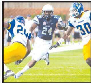
SEASON OPENER --page 5