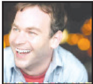
MIKE BIRBIGLIA --page 4