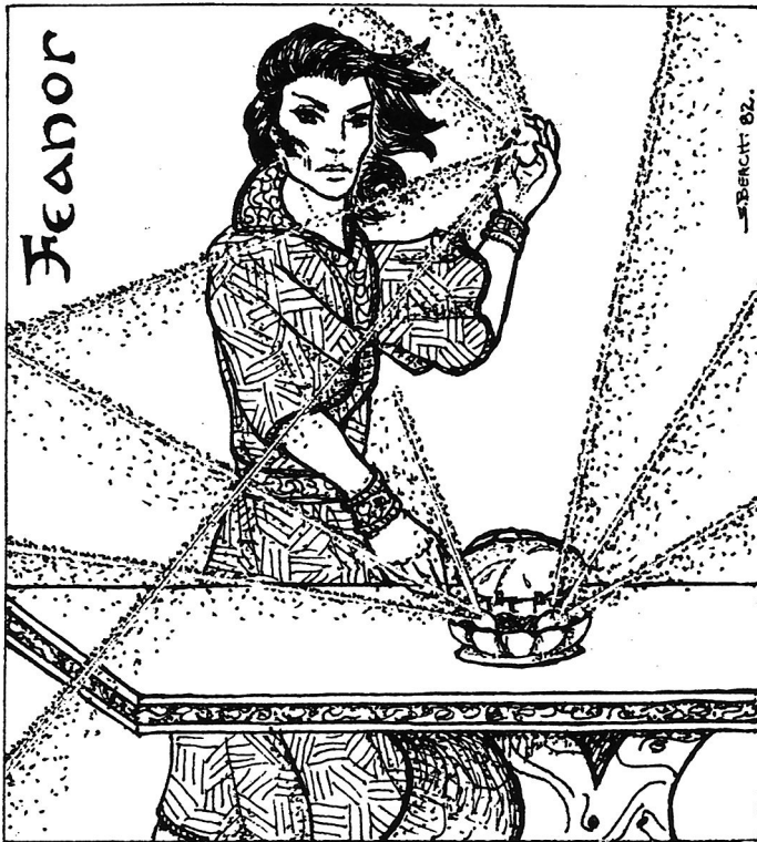
From chapter 7 of J. R. R. Tolkien's The Silmarillion