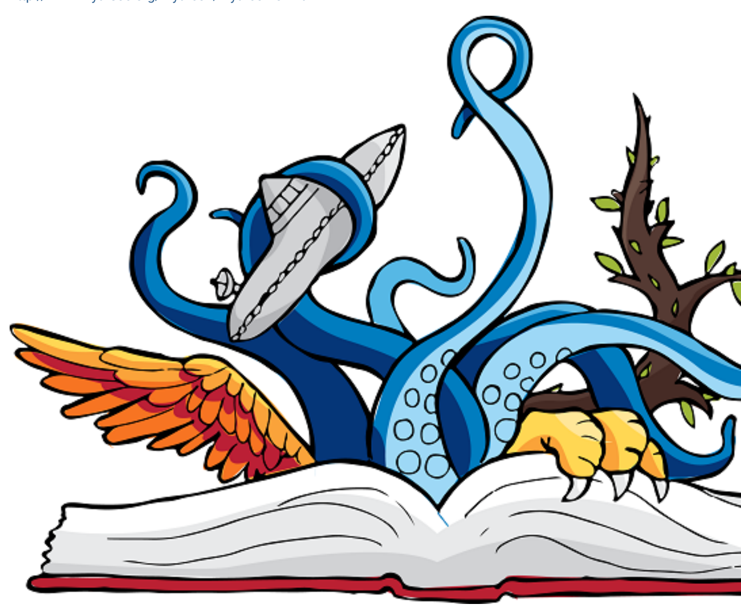
Mythcon 52: The Mythic, the Fantastic, and the Alien

http://www.mythsoc.org/mythcon/mythcon-51.htm