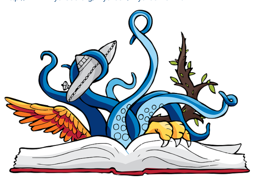
Mythcon 52: The Mythic, the Fantastic, and the Alien Albuquerque, New Mexico; July 29 - August 1, 2022

July 31 - August 1, 2021 (Saturday and Sunday) http://www.mythsoc.org/mythcon/mythcon-51.htm