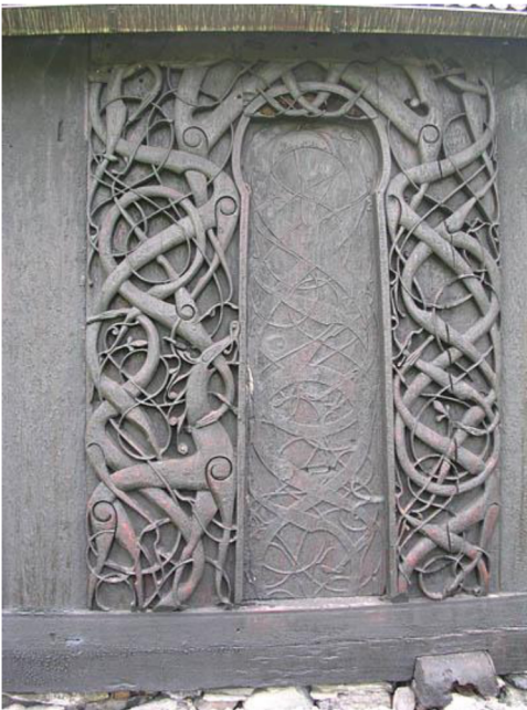
Figure 2. Portal at Urnes in Sognefjord.