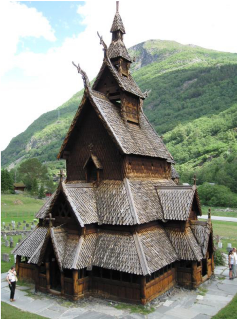
Figure 1. Stave church at Borgund.