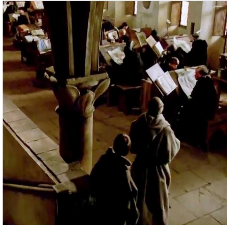
Annaud, J. J. (Director). (1986). The Name of the rose [Video file]. Italy: Neue Constantin Film.