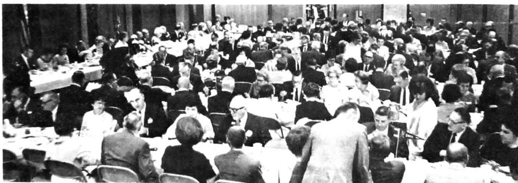
THE HALL OF FAME installation banquet brought a large number of former Southwestern wrestlers together for the first time in years. And they made the most of the situation, as they reminisced and swapped stories about post-college days. This is a view of part of the crowd attending the banquet in the college Memorial Student Center. For many, this was the first visit to the campus since they graduated in the 1930's.