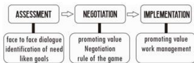
Scheme 2. The Collaboration Process of Tobatan

Then negotiation begins with promoting value to increase relationship density is to politeness, hospitality, honesty and smile. Consistency in elevating these values is the cause of administrative loosening. The 'rules of the game' that were set at the beginning, shifted because of the strength of the value. This study has provided a new indicator of the phase of negotiation that interaction must not only be built with written bonds, but also promote value. Implementation is the final step in building collaboration. This stage starts from the signing or agreement of cooperation. The agreement will guide the work management process which is related to the distribution of goods or the reorder mechanism.