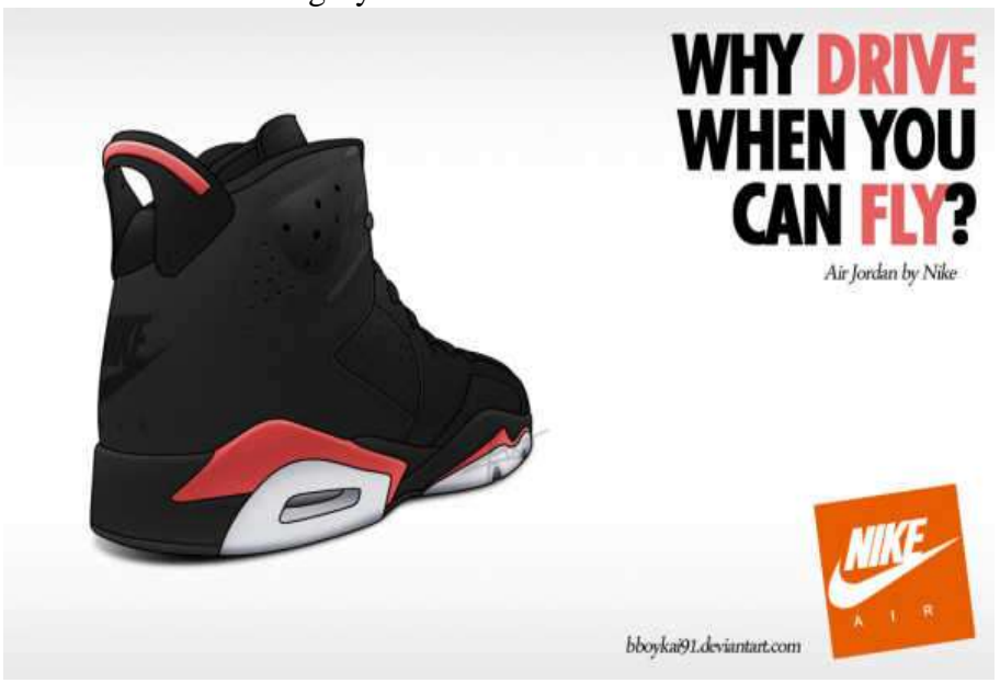
Figure 5,- Nike "Why drive when you can fly?"

The signifiers used in this ad reveal to the picture of black-red shoe with famous brand NIKE and also the tagline "Why drive when you can fly?" This ad is signified as the product of shoes which serve comfortable for the user.