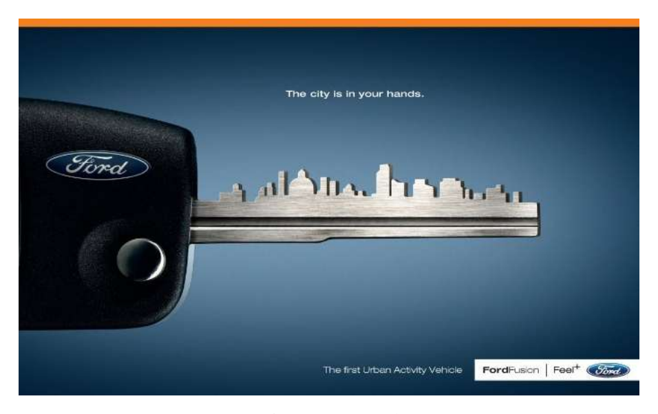
Figure 4.6,- Ford "The city is in your hands"

Freedom as it is served by the product contains connotative meaning as the way people look their life freely without a pressure and limit. The way people think, the way they speak, the way they argue, as well as the way they behave as will be as "their belonging" to the way they do the living. Freedom in this sense should play as the positive path for people to walk around their living. There is still, however, norms and cultural values of life would be the best escorts to balance people's mind to do something positive by its freedom. The term Freedom could be best described as "free with wisdom". Take the freedom as we take it as wisdom.