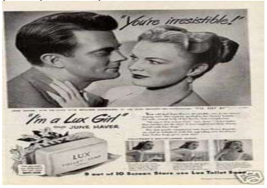
Figure 3,- Lux "You're irresistible! I'm a Lux Girl"

Several signifiers are identified in this ad, they are the picture of a romantic couple, three other pictures of girls, and the tagline "You're irresistible! I'm a Lux Girl". This ad is signified as the product of soap which offers luxurious experience in bathing.