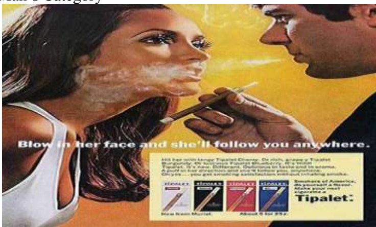
Figure 1,- Tipalet "Blow in her face and she'll follow you anywhere"