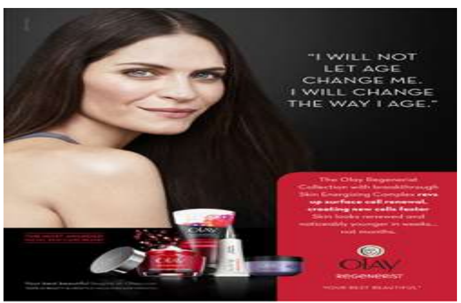
Figure 4,- Olay "I will not let age change me. I will change the way I age.

will not pay "a hard-working" oriented for more. Therefore, people have to change their mind that "luck" is only one of the external factors of the success since it is believed that only by praying and working hard will take people to the real success both in the world and in the life after.