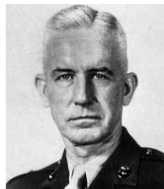
MajGen O. P. Smith

The Situation. 5) General Smith is included in this list of outstanding leaders primarily for his actions during November and December 1950 while leading the 1st Marine Division in North Korea. Born October 26, 1893, General Smith was commissioned a second lieutenant in the Marine Corps Reserve in April 1917. General Smith saw duty in the Banana