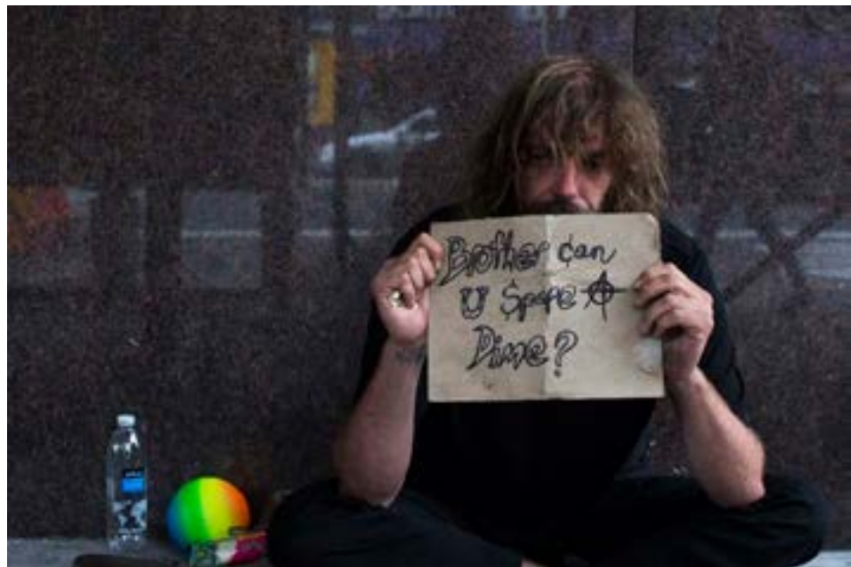
19th Street, 2017. When I asked him if I could photograph him, he said yes. Upon thanking him for letting me snap a shot, he went on a rant on how Americans are the real terrorists and that Muslims just want to be left alone.