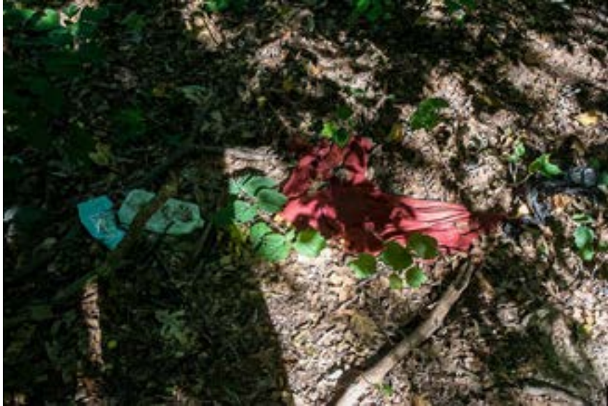
Evidence, Forest Park — NY, 2017.