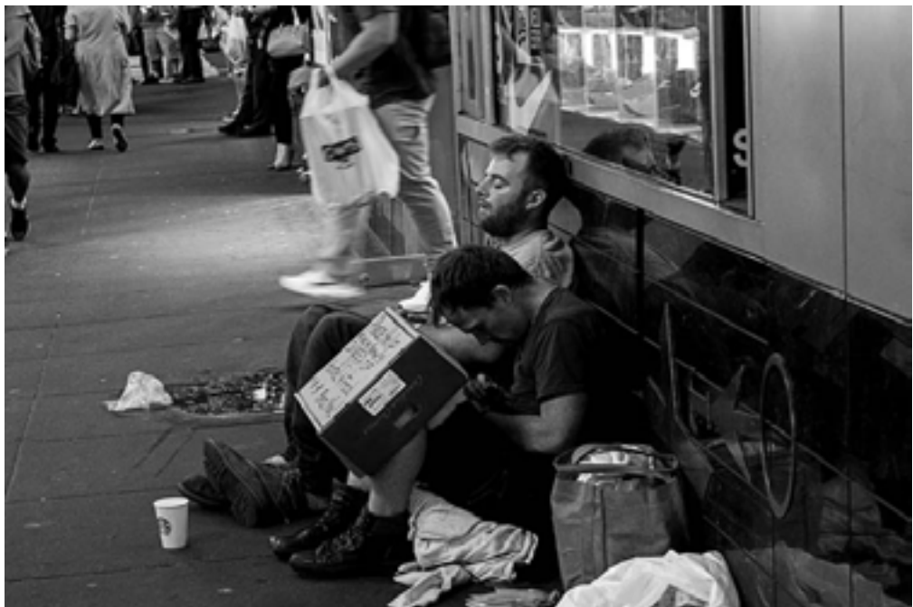
Champs Sports, Times Square — NY, 8:54pm 09/07/2017.