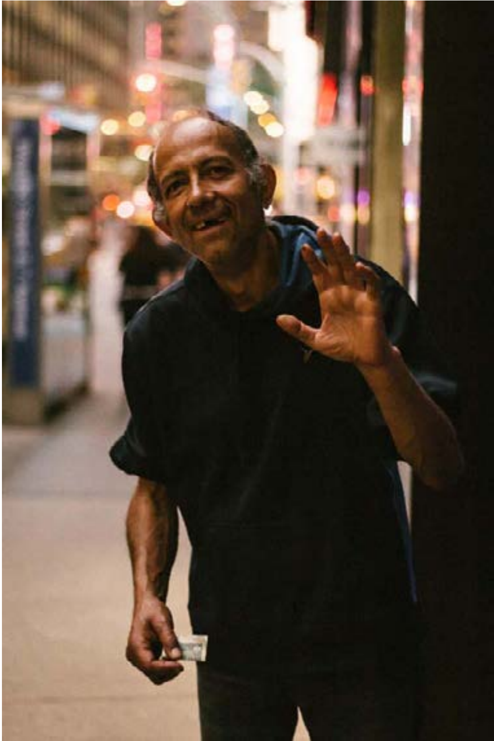
Unknown, Midtown Manhattan, 2017.