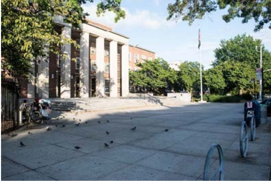
Justice, Queens County Courthouse — NY, 2017.