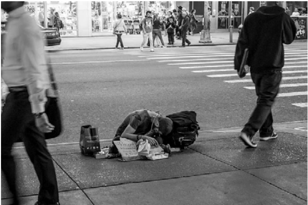
Man Sleeping in Front of Street, Times Square — NY, 7:22pm 09/07/2017.

“These images were mostly taken from a distance. I wanted to take a step back and capture what these people really look like, from the man who was pretending to sleep on the sidewalk, to the two men sleeping in front of Champs. The husband and wife I photographed were willing to participate as long as they did not have to talk about their stories. They thought their sign said it all. They also did not want to see the photos afterwards. These photos made me realize how bad homelessness has gotten.”