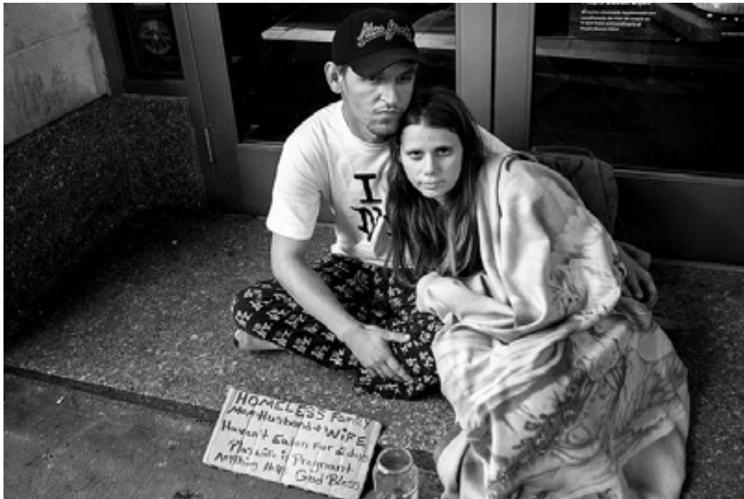
Husband and Wife, Times Square — NY, 2:18pm 09/28/17.