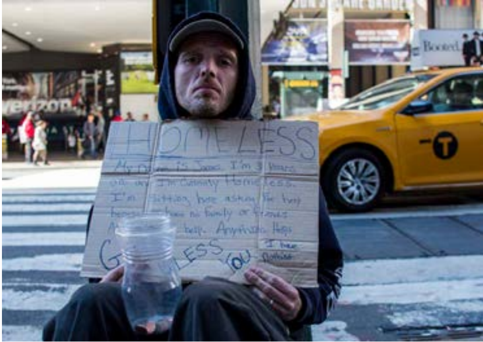
32nd Street, 2017.