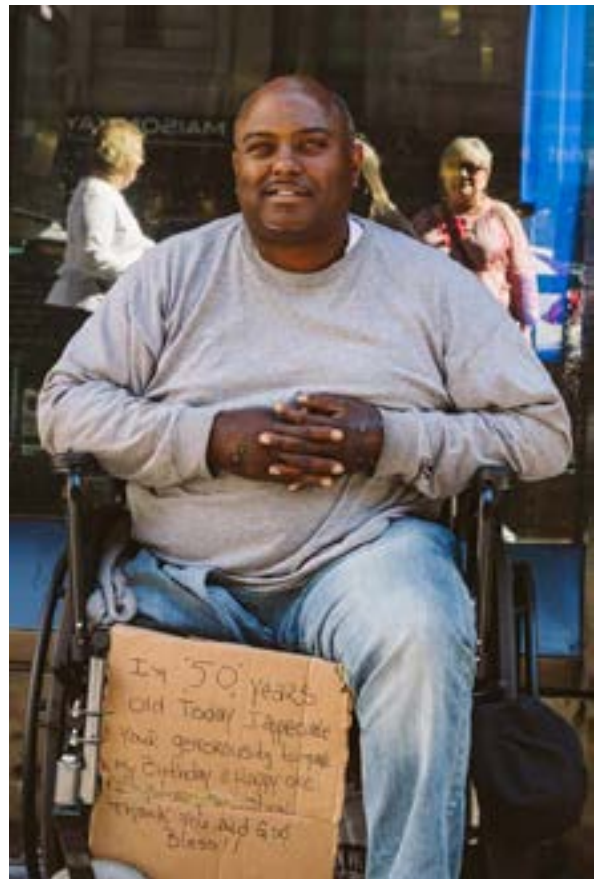
Happy 50th, Midtown Manhattan, 2017.