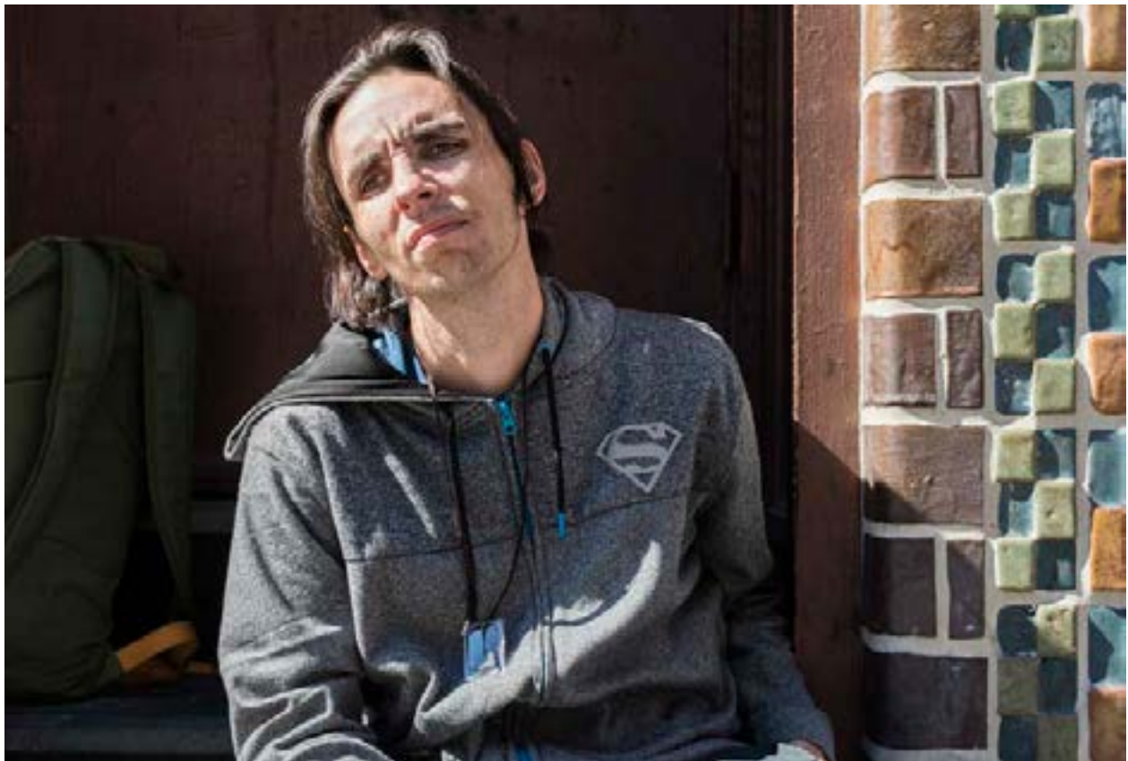
8th Avenue, 2017.

The resulting images were presented as a large scale exhibition during the 10th Biennial Vincentian Chair of Social Justice Conference: “A Focus On The Common Good: Homelessness And The Need For Systematic Change”, during the fall 2017 at St. John’s University.