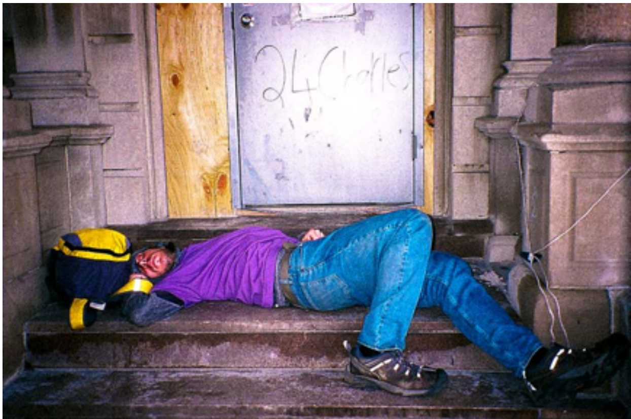
Man On Stoop, Greenwich Village — NY, 2017.

I felt it was very difficult to find a respectful and natural way of capturing the life of homeless people in NYC. Even after changing my approach, it continued to be quite difficult and even a little dangerous, but I feel this experience was worthwhile and taught me much, not only as a photographer, but most importantly as a person.”