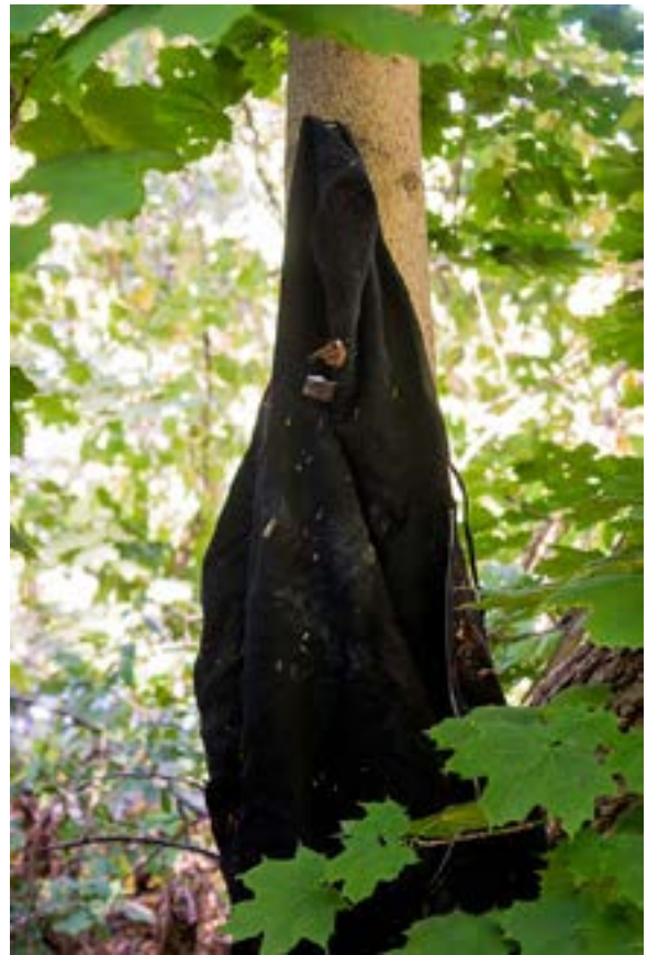
A Cold Day, Forest Park — NY, 2017.