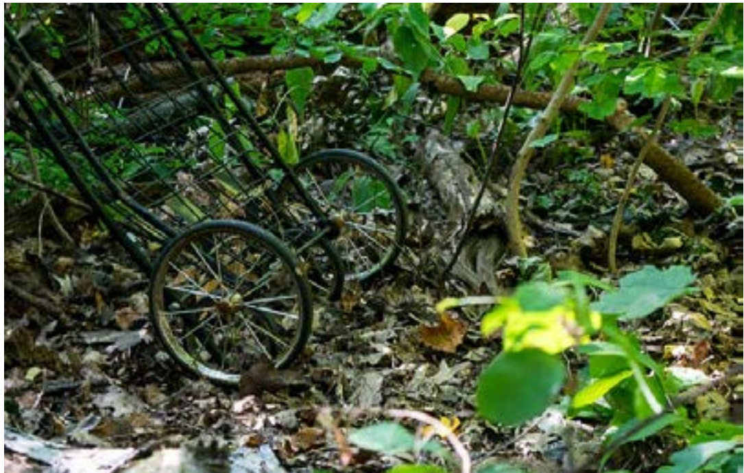
Hidden, Forest Park — NY, 2017.