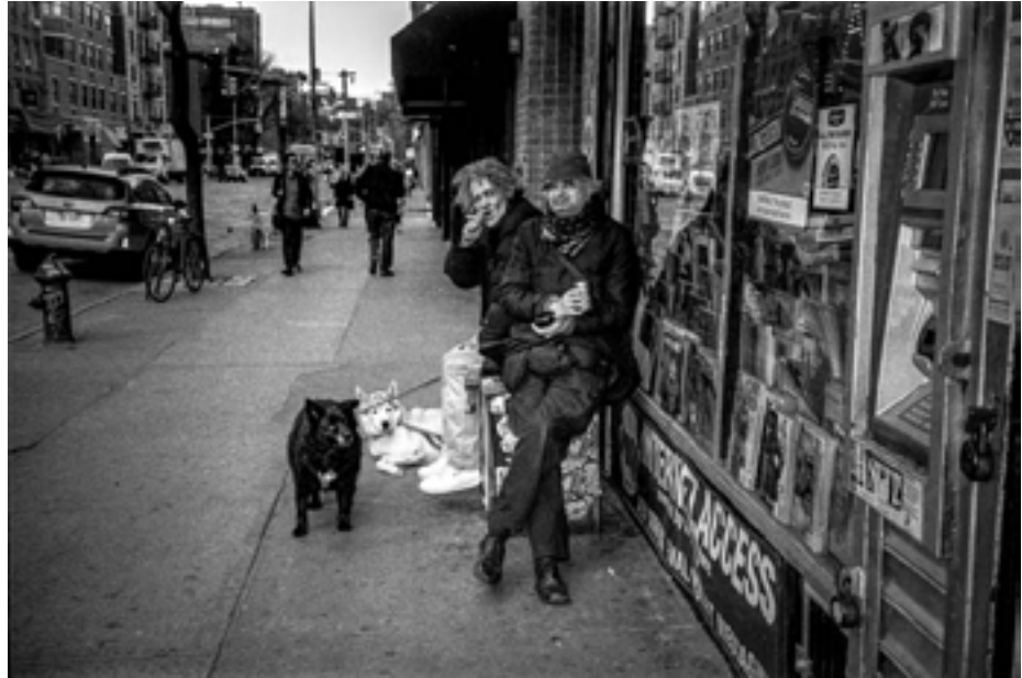
Loosey Dogs, East Village — NY, 2017.