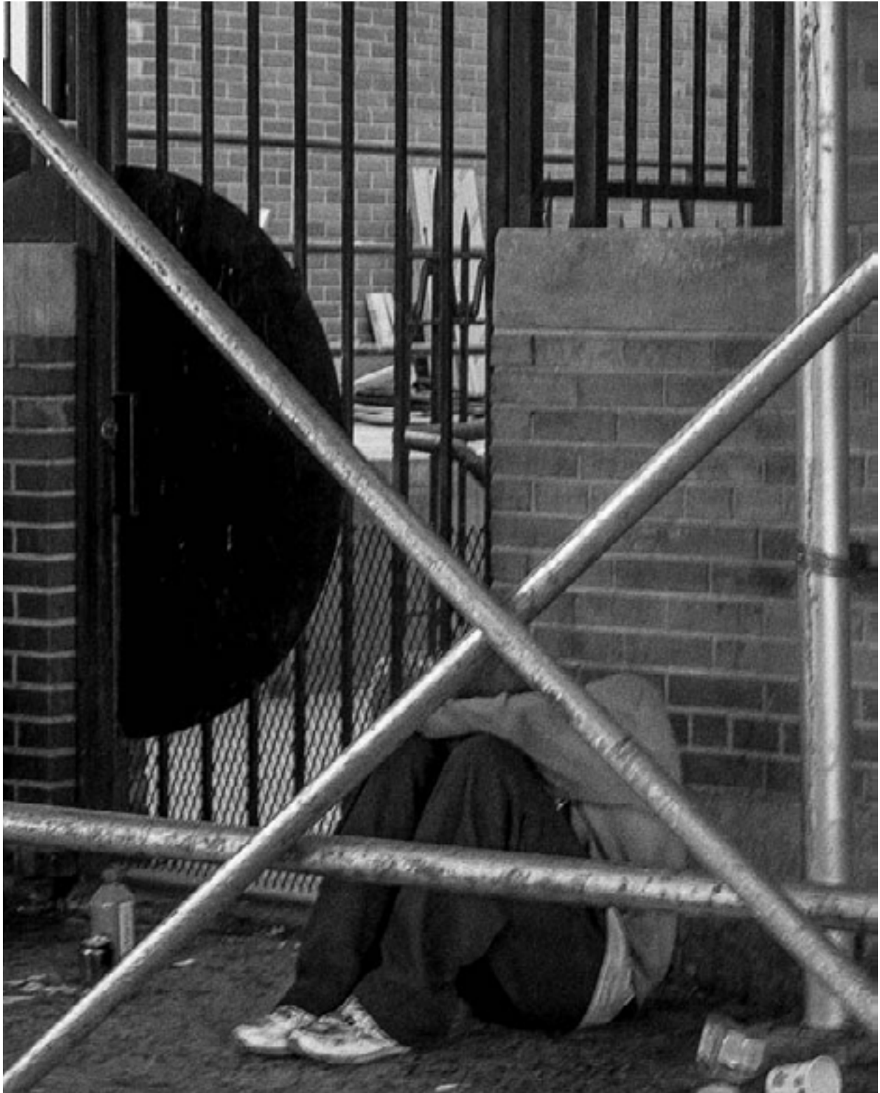
168th Street Station, Washington Heights — NY, 3:18pm 09/27/2017.