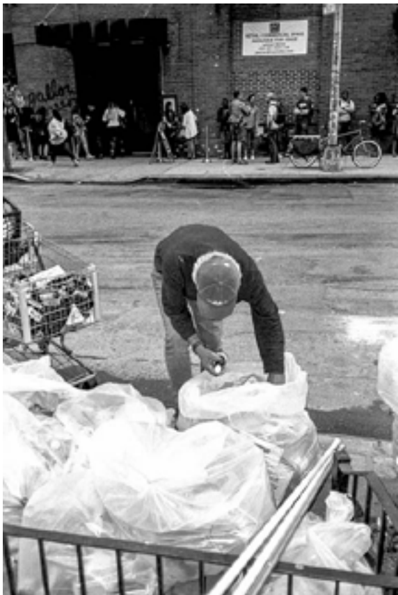
Trash Picking in Chelsea, Chelsea — NY, 2017.