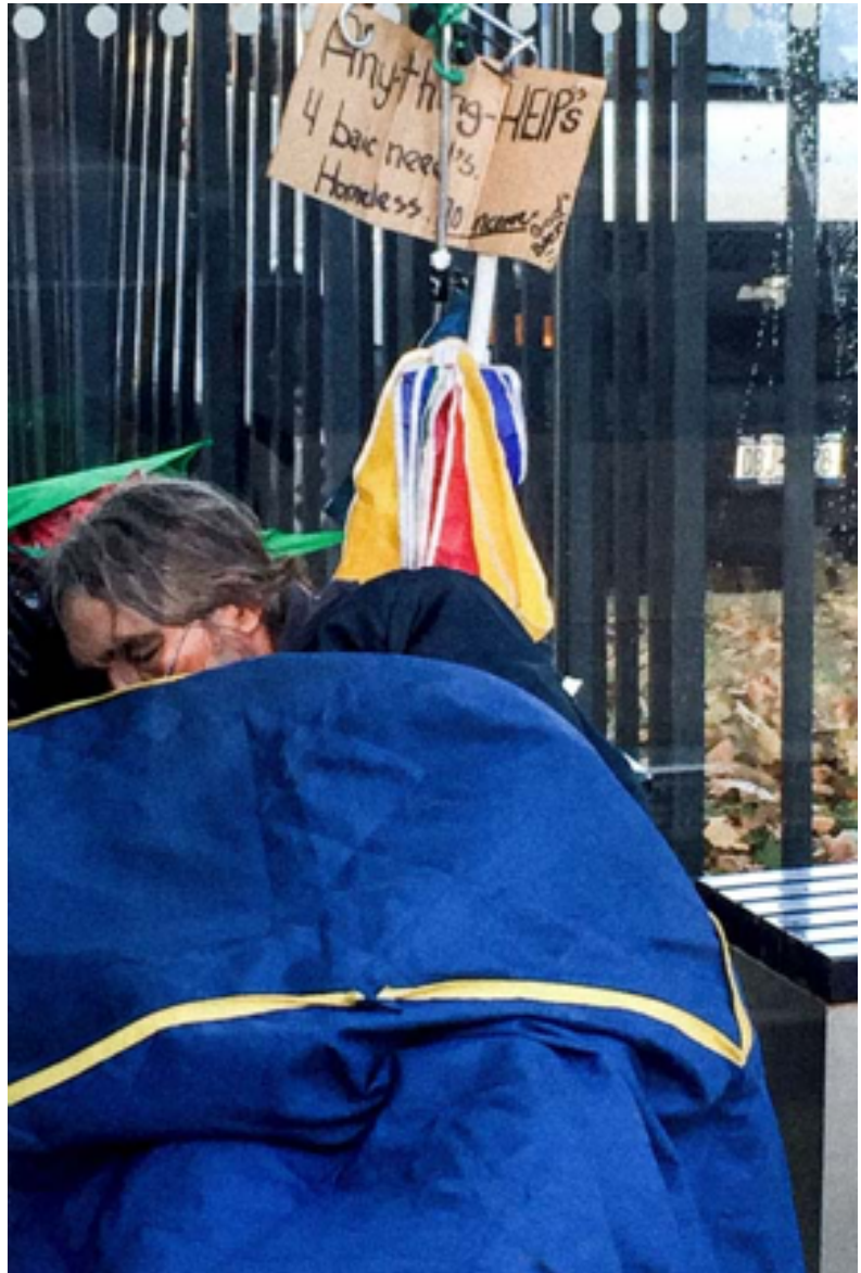
A Late Riser, Utopia Parkway — NY, 2017.

“This project served as an opportunity to pay greater attention to my surroundings as I went about my day in Queens. It resulted in me noticing aspects of the community which, I had hitherto paid little attention to. The presence of these previously unnoticed experiences gave me insight into the lives of a population that lived under very different circumstances to my own. Notably, the two images titled “Evidence” and “A Late Riser” served as a reminder of the similarities as well as the differences.”