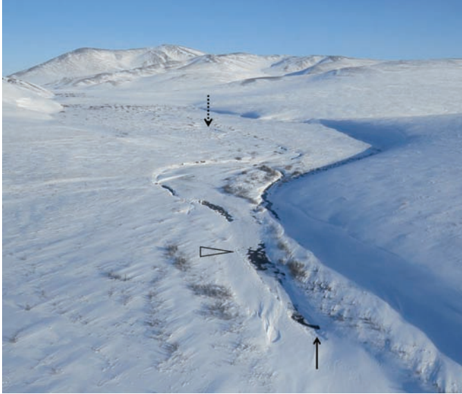
FIG. 2. A perennial groundwater spring in Fish Creek, Yukon, in Ivvavik National Park on 8 March 2018 taken from a helicopter approximately 50 m above the ground. Vertical arrows indicate the upper (solid line) and lower (dashed line) extent of open water sections (stretch of river between arrows was ~730 m in length). The width of open water at the open triangle is 4.25 m. Image is facing northeast with Mount Conybeare (highest peak) in the background.

could increase our understanding of how diet influences energetic thresholds and affects the decision to overwinter or migrate to more southern overwintering areas. Future surveys to document additional locations where American Dipper overwinter in river systems draining the North Slope region should use the maps provided by Craig and McCart (1974) and Kane et al. (2013) to assist with site selection. Many of the specific locations mentioned by Craig and McCart (1974) are also inhabited by Dolly Varden.