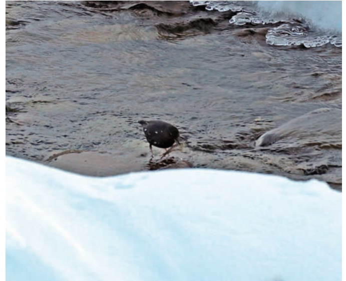
FIG. 3. American Dipper in Fish Creek, Yukon, in Ivvavik National Park with a juvenile Dolly Varden in its beak (8 March 2018).

In addition to documenting the northernmost observation of American Dipper in Canada, we characterized open-water habitat of a previously undescribed river system in Ivvavik National Park and provided novel photographic evidence demonstrating that American Dippers prey on juvenile Dolly Varden during winter. Documenting