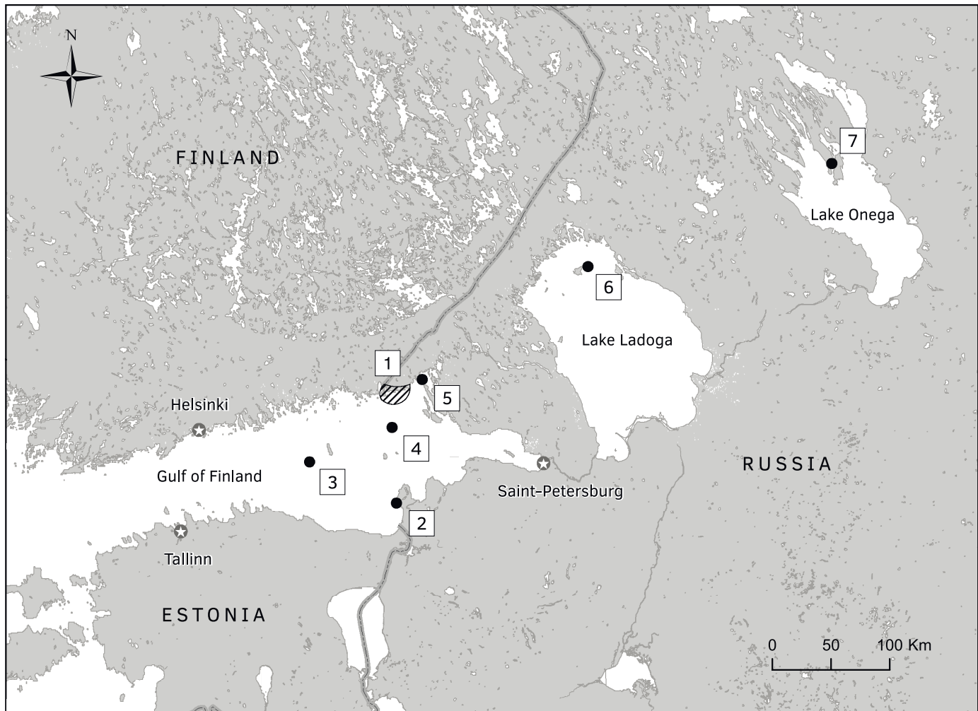
FIG. 1. Distribution of Barnacle Goose nests in the eastern part of the Gulf of Finland in 1995–2015. 1 – Islands near the northern coast of the Gulf of Finland (Dolgy Reef, Bolshoy Fiskar Archipelago, Galochy, Malaya Otmel, Kamennaya Zemlya, Vostochny Greben, Zapadny Greben, Ryabinnik, Maly Fiskar, Tuman), 2 – Reymosar, 3 – Rodsher, 4 – Nerva, 5 – Stoglaz, 6 – Valaam Archipelago, 7 – Kizhi Archipelago.

2013, 2014; our data) (Table 1) using the same methods. The islands are small, and all goose nests on each island visited were found. An explosive growth in the number of nesting Barnacle Geese was observed in 2014–15 in the eastern part of the Gulf of Finland; 40 nests were found in 2014 and 76 in 2015 (Table 1). In these years a further expansion of the nesting area in the northern part of the Gulf of Finland was observed. In 2014, Barnacle Geese started to reproduce on Vostochny Greben and Kamennaya Zemlya Islands, and in 2015 on Zapadnyy Greben, Tuman, and Stoglaz Islands (Khrabryi and Baibekova, 2016; our data) (Figs. 1, 2).