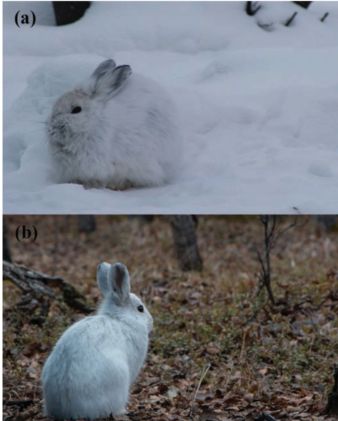
FIG. 2. Examples of a snowshoe hare that is a) completely matched, and b) completely mismatched.

(Stenseth et al., 2004), reducing the escape potential of hares, or changing encounter rates (Vucic-Pestic et al., 2011). To understand how climate variability affects snowshoe hares, we require detailed knowledge of both winter conditions and hare survival patterns.