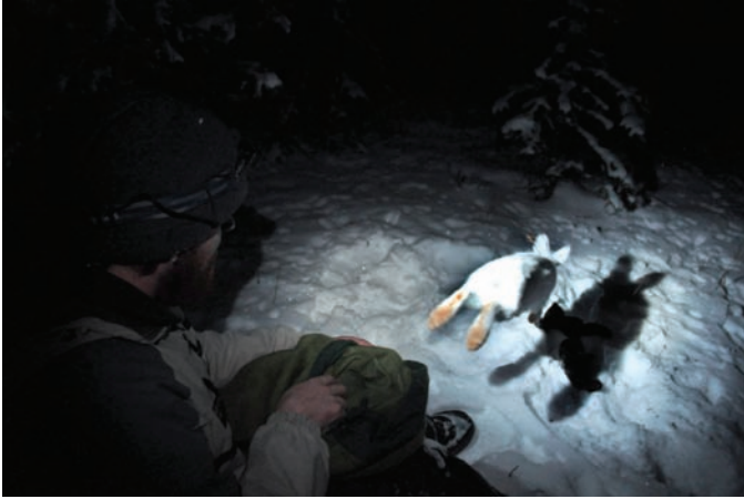
FIG. 3. Releasing a collared snowshoe hare on our study grid in the Kluane Lake region, Yukon.

and Lane, 2014). The few individuals that were monitored for consecutive years demonstrated large plasticity in colour change rates (i.e., 15–20 days; Zimova et al., 2014). This example indicates that we need to examine more populations to fully understand the plasticity of moulting rates in the species. Since 2015, the coat colour of individuals in the Kluane Lake region has been monitored once a week throughout the fall and spring moults using either trapping or telemetry. An array of trail cameras was established within the study area to monitor snow cover changes. I will examine how population and individual colour change rates vary across years and whether they match the yearly differences in snow cover. Large-scale trapping allowed for an increased number of individuals to be monitored across consecutive years to better our understanding of individual plasticity in moulting. Coincidentally, the spring of 2016 was one of the earliest snow melts experienced in the Kluane Lake region, while 2017 was more representative of the past. This difference allows for a strong examination of individual plasticity in coat-colour change for the species.