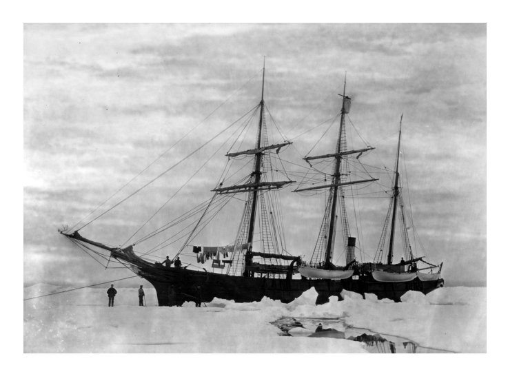
FIG. 4. The steam-assisted schooner Diana in the ice near Lågøya off the north coast of Svalbard during Benjamin Leigh Smith's expedition of 1873.