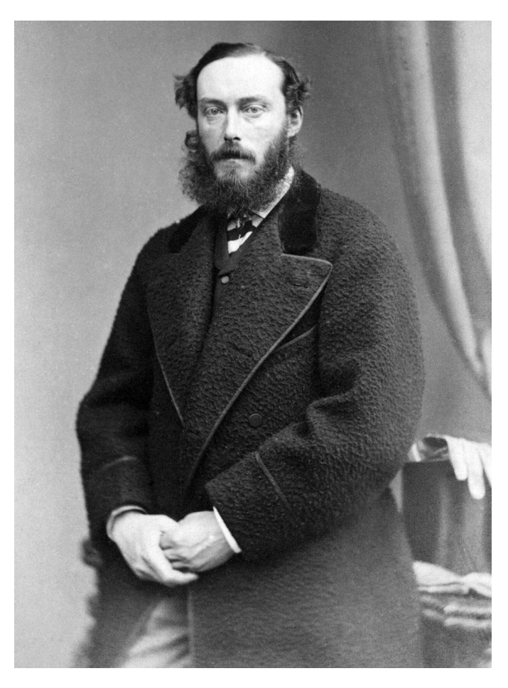
FIG. 2. Sir James Lamont of Knockdow.

allowed Lamont to purchase Ginevra , which carried him throughout the Mediterranean, across the Atlantic to Labrador, and then into Arctic waters.