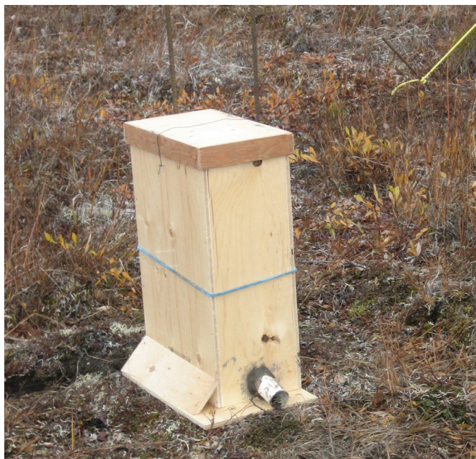
FIG. 1. Picture of a trapping box on Herschel Island.

lemmings (7/40), brown lemmings (2/40), or both species (4/40), but only brown lemmings used the boxes in 2011. Signs of reproduction were found in one box in 2011 and none in 2010. Winter nests were also found near 15 boxes in 2010 and 19 boxes in 2011. Stoats ( Mustela erminea ) used some boxes (1/40 in 2010 and 4/40 in 2011) to store lemmings they had killed in the surrounding area or, in one case, the lemmings occupying a nest built inside a box. No lemmings were caught in the boxes in spring, despite all the sign of winter use and even though lemmings were at high densities during both winters (G. Gauthier and F. Bilodeau, unpubl. data).