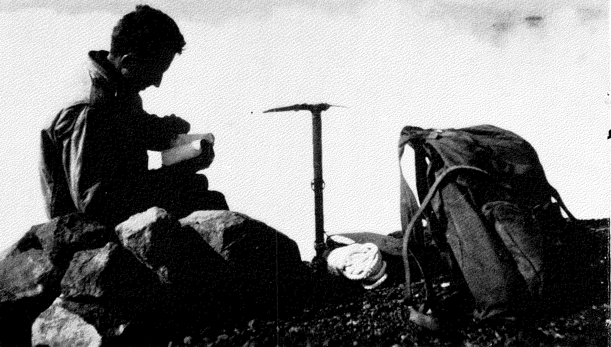
Survey geologist taking notes on Kiska volcano, Aleutian Islands.