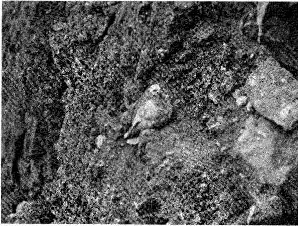
Fig. 3. Cape Searle is not a suitable place for photographing fulmars at the nest because of their inaccessibility. This bird is an 'intermediate' in plumage.

Clearwater Fiord at the very head of Cumberland Sound, the unexpected sight of a fulmar, or perhaps a shearwater, could have been the occasion of giving the name, since it is a place where fulmars are unlikely ever to be particularly numerous.