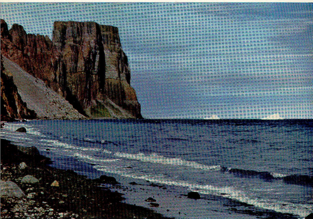
Fig. 1. Cape Searle.