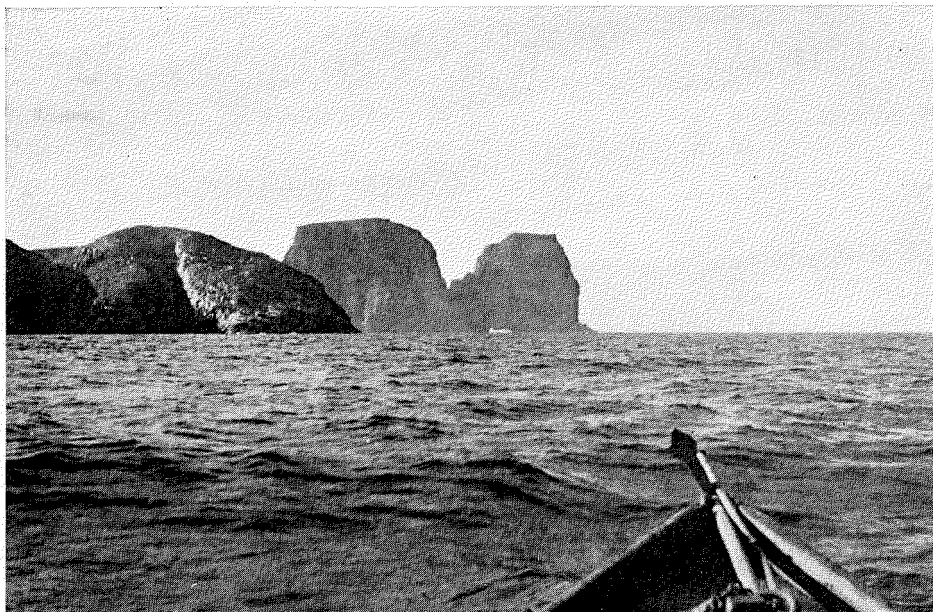
Fig. 6. The towers of Cape Searle from the southeast.

The white-headed birds were much the most easily seen when sitting on the ledges, and there appeared to be about one of them in every five or six birds (23/126); but more careful counts made later at the tide-rip gave 44 light-phase in 373, or 12 per cent. The remainder were for the most part intermediate in shade, and only a similarly small proportion was really dark (some of them of a depth of grey seldom if ever found in the Atlantic sub-species).