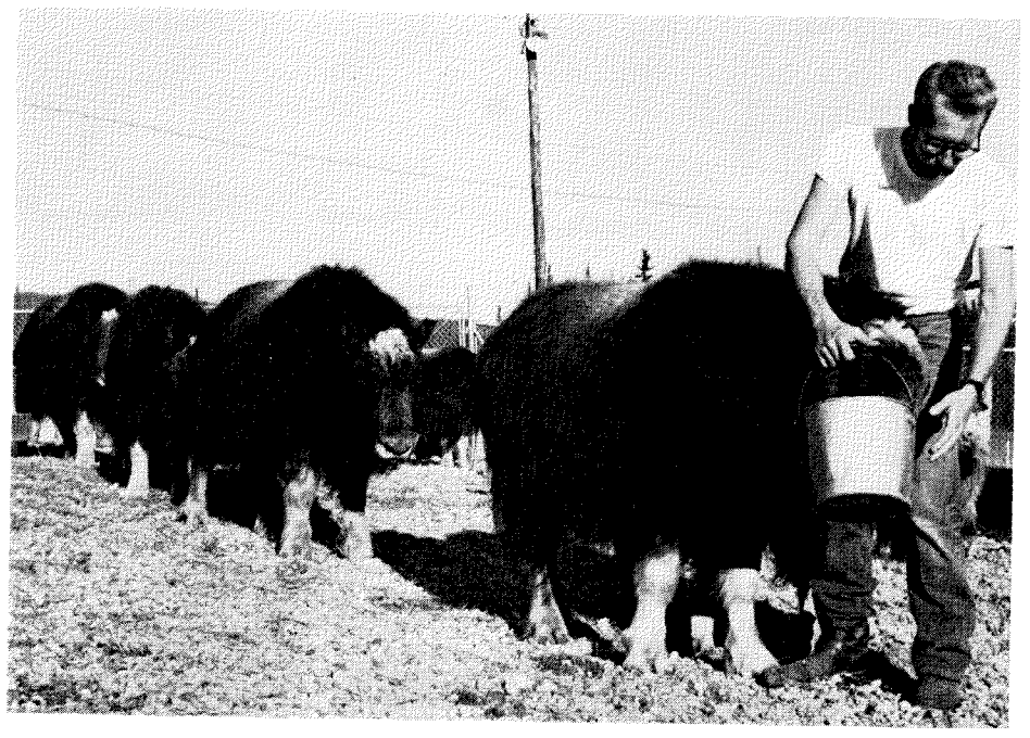
Young musk oxen in a domestication experiment being undertaken by the University of Alaska in collaboration with the Institute of Northern Agricultural Research. The project is supported by the W. K. Kellogg Foundation.

ments, and the potential value of their very fine wool (qiviut) they may well form the base of an economy in native villages. By ingenious and somewhat rugged methods from the viewpoint of the capturers, thirty-three yearlings have been taken from the stock on Nunivak Island and transported to the campus farm. There they are growing well and are fast assuming the predicted docility.