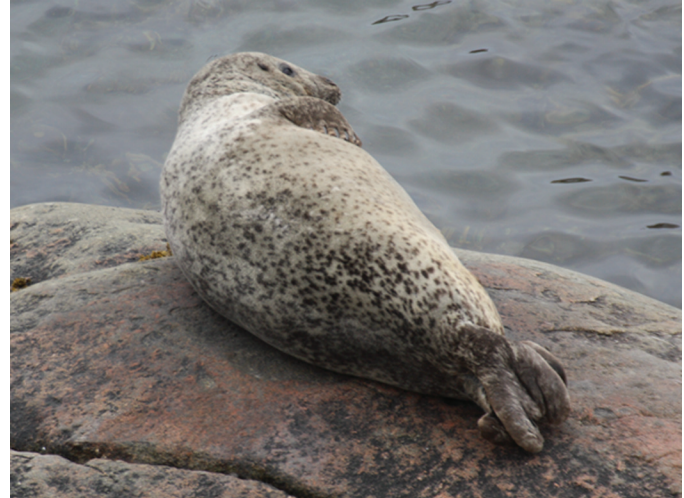
FIG. 3. Picture of what is possibly a young grey seal, taken at the same position as in Figure 2 on the following day, 31 August 2009.

The settlement closest to the harbour seal colony is Aapilattoq, located approximately 50 km to the west. During community meetings in November 2009, hunters from this settlement were asked if they had ever seen grey seals before. Two hunters claimed that they had seen these seals before, but that they are very rare. One elder remembered