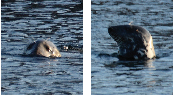
FIG. 2. A grey seal observed in southern Greenland at 59°53' N, 43°28' W on 30 August 2009.