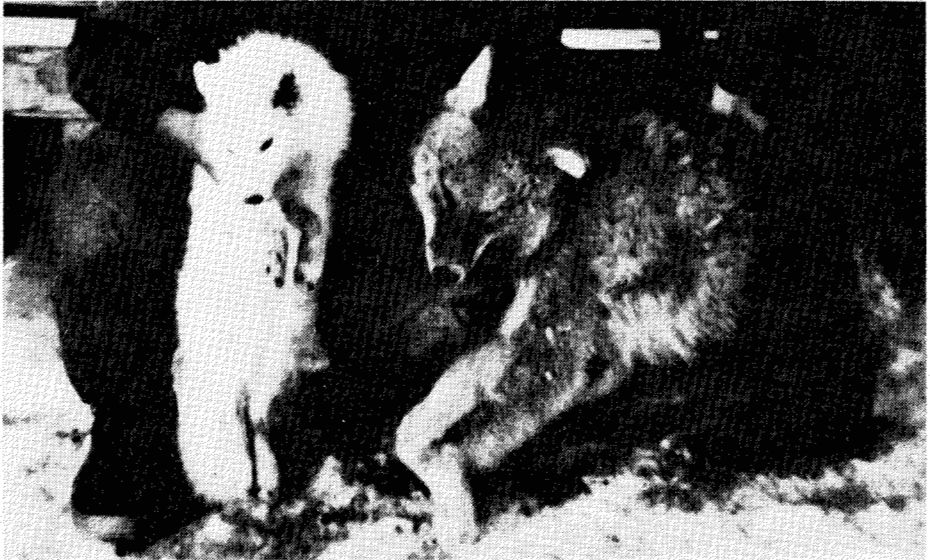
FIG. 1 Arctic fox and coyote collected at East Shoal Lake, Manitoba.

the barren grounds of the District of Keewatin in the Northwest Territories during the winter of 1974-75.