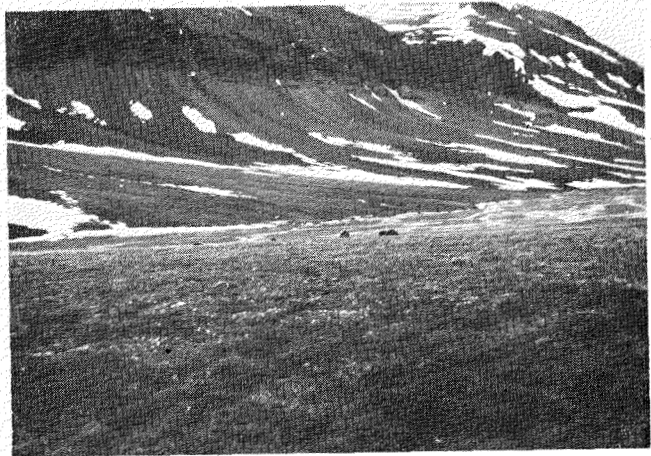
FIG. 3. General view of Horsedal on 6 July 1974. Such valleys are fairly typical of this part of Greenland. A small party of four muskoxen can be seen in the centre of the photograph.

Muskox densities were about three times as high in northern Jameson Land as they were in northern Scoresby Land, and this reflects the larger area of suitable feeding grounds available. Particularly favoured during July were early drying stream beds and meadows of moss and sedge. In the former situation, animals could clearly be seen to take fresh growths of Salix arctica . In drier areas, Betula nana , Cassiope tetragona and Vaccinium uliginosum were present in abundance, but muskoxen were not often seen feeding on these plants. Reindeer show a similar