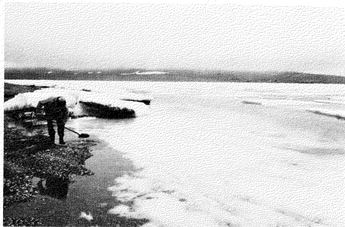
FIG. 2. Fresh water anchor ice along in Resolute Bay, N.W.T. in August, 1978. The photograph was taken at low tide and the water depth over the inner margin of the ice is about 20 cm. The maximum tidal range is 2.0 m and striations on the surface of the anchor ice are caused by gravel frozen into moving floes. The small blocks of sea ice grounded on the anchor ice are about 1.5 m thick and have a layer of gravel adhering to the bottom.

extending 2-5 m seawards from the Lower Low Water Springs line and having a typical thickness of 0.5 m (Fig. 2). Where it could be seen, the surface was striated, apparently by gravel frozen into moving ice blocks, but no gravel was found in the body of the fresh-water ice itself. Grounded floes covered part of the belt and in some places there was a thin covering of loose gravel on its upper surface which had been deposited by the melting of ice grounded on top. The lower surface of the anchor ice was continuous with interstitial ice in the undisturbed gravel of the sea bed. A Sipre auger was used to obtain 7.5 cm diameter vertical cores through the belt, 2-cm thick samples being cut at 10-cm intervals along the core. After