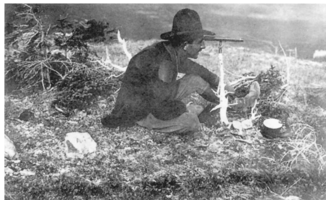
T.A. Link conducting geological surveys from on top of Bear Rock, Northwest Territories, 80 km south of the Norman Wells oilfield.

Link and an assistant were also sent to the area in 1919 to continue surveying claims, to further investigate the geology of the area, and to oversee the drilling of the well. Link chose the location of the prospect well on flat ground, safe from ice-jams, close to a water supply for drilling, near a good landing place for the supply ships, and in the centre of the oil seepage area. Link and his assistant returned south in the fall of 1919, but the next spring Link returned with a relief crew and arrived at the well site on 8 July. The well was already 95 m deep when the new crew took over drilling. On the day of the