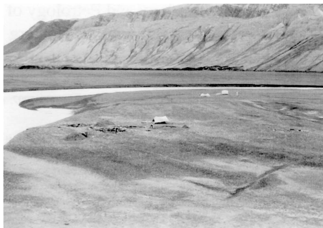
FIG. 2. The Buchanan Lake site, SiHw-1.

The relatively high vitrinite reflectance level makes it unlikely that the specimen originated in the nearby coal