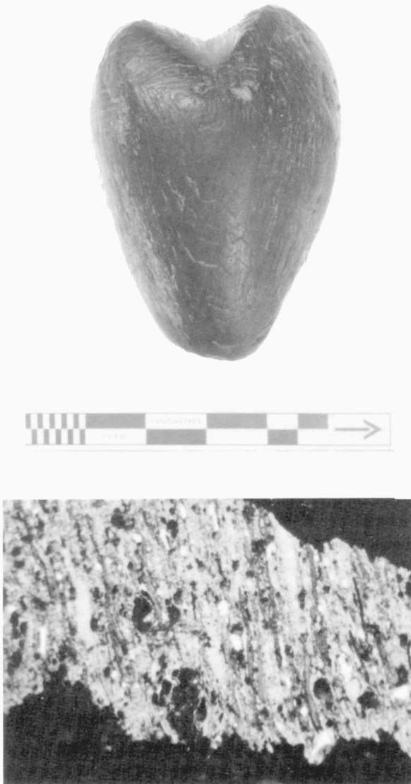
FIG. 3. A) Coal artifact SiHw-1:650. Specimen has been carved and polished to the form of a stylized whale. Maximum dimension is 58 mm. B) Micrograph showing fine-grained clay minerals, with inclusions of inertodetrinite (bright) and sporinite (dark stringers). White-light illumination; long axis of photograph is 200 microns long.

1987). In other words, the alginite-rich boghead coal investigated in this study may well be characterized by a depressed reflectance value in the order of 0.4–0.5% R_{\text{random}} , and the coal rank may be higher than that indicated by vitrinite reflectance.