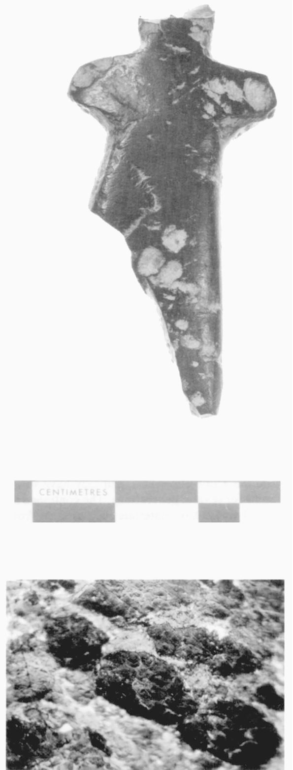
FIG. 4. A) Coal artifact SiHw-1:636. Specimen has been carved and polished to the form of a human figure. Part of the head and one leg are broken off. Maximum dimension is 50 mm. B) Micrograph showing Botryococcus alginite, showing cauliflower-like internal structure. Dark alginite bodies are separated from each other by medium-gray vitrinite matrix. White-light illumination; long axis of photograph is 200 microns long.

The material of this artifact is strikingly similar to that determined in coal beads from Thule settlements located on the east coast of Ellesmere Island (Kalkreuth et al., 1993a), indicating a common source for these specimens. The massive boghead coal appears to have been particularly suitable for carving delicate ornaments and figurines, such as the artifact described here and the beads and the possible labret found in the Bache Peninsula region of Ellesmere Island. As with the stylized whale artifact (SiHw-1:650), the origin of the boghead coal is uncertain.