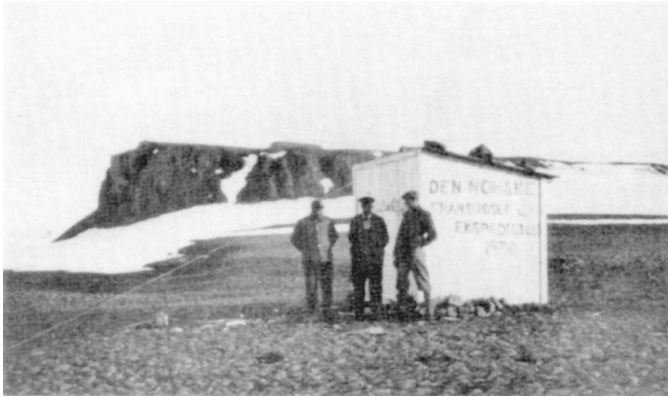
FIG. 4. Cabin erected at Cape Forbes, George Land in Franz Josef Land in August 1930.

So why did the annexation take place, in spite of the prime minister's change of heart? We can only make a qualified guess. We believe it is reasonable to assume that the annexation of Victoria Island was carried out by a group of enthusiasts situated in influential positions within the bureaucracy, despite the withdrawal of official governmental support. The following information may support this view.