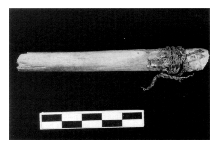
FIG. 4. Close-up of the fletched end of the dart/arrow, showing a remnant of the feather shaft under the sinew tie. Scale is in centimetres.

sinew tie. The feathers are as yet unidentified as to species. The feathers are split, but the halves remain attached by the keratinous outer membrane and lie open against the shaft. It is not possible to determine if the feathers were tied near the top as well as at the bottom, as the extreme proximal end of the dart shaft is missing.