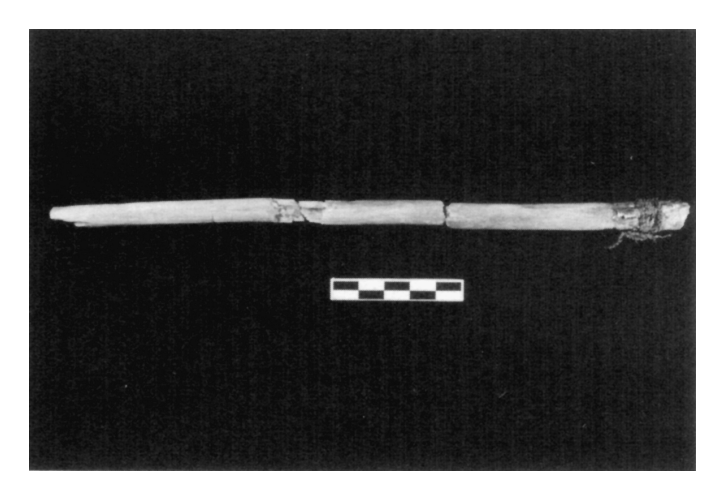
FIG. 3. Thandlät dart/arrow fragment.

Samples submitted to Isotrace laboratories for AMS dating yielded the following results: the caribou fecal pellet from the base of the ice core returned a date of 2450 B.P. \pm 50 (TO-6871); the dart shaft fragment was dated at 4360 B.P. \pm 50 (TO-6870). With ice thickness estimated at 5–10 m, it is possible that the Thandlät snow patch contains a record of ice with layers of caribou fecal pellets extending back in time more than 4000 years.