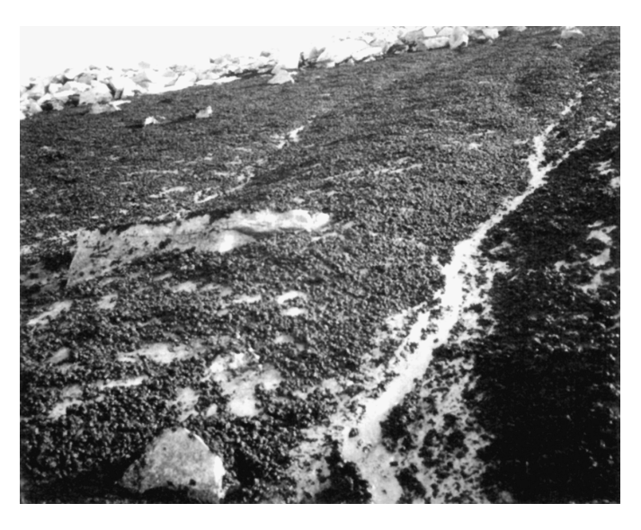
FIG. 5. View of line of boulders above Thandlät snow patch that may have been used as a hunting blind.

The high percentage of lichen found in the pellet sample indicates that caribou rather than Dall sheep ( Ovis dalli ) were responsible for the fecal pellet concentration on Thandlät (Hoefs and McTaggart-Cowan, 1979).