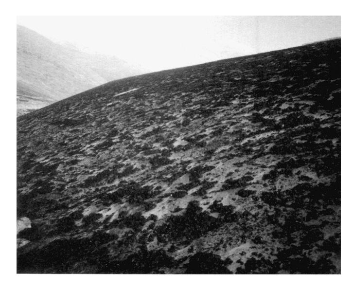
FIG. 2. View of a portion of the Thandlät snow patch, showing extensive deposits of caribou dung exposed by melting. The snow patch is about 750 m long by 300 m wide, with a slope of approximately 40^{\circ} .

12 September 1997, small quantities of fecal pellets were collected from several localities on the surface of the snow patch for dietary analysis. In addition, several faunal samples were collected, including a caribou mandible, a long bone fragment, and a small clump of hair. The proximal end of a feathered dart or arrow shaft was recovered on the edge of the snow patch. The site was revisited on 29 September 1997. A 205 cm Sipre ice core auger was used to sample subsurface ice deposits. A core of ice approximately 160 cm long revealed caribou fecal pellets present intermittently throughout the core to the base. Planned survey of the site for additional biological and cultural materials was prevented by a fall of snow that had occurred the previous night.