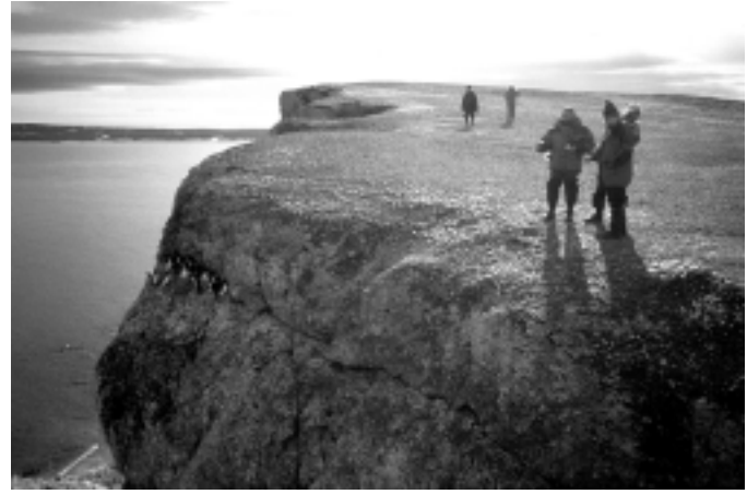
FIG. 5. View towards Cape Carlsen from the western Orange Island. Note birds ( U. lomvia ; murre) in the cliffs.

The coasts of northern Novaya Zemlya are easily accessed via beaches 100–500 m wide, which have undulating ridges of loose gravel and large, rounded cobbles, and end in an escarpment over 5 m high. The escarpment is covered in many places by steep, partly glacierized snowbanks, which have retreated under 20th century warming. Retreat of the snowbanks released a large number of skeletal remains, which have been identified as whale,