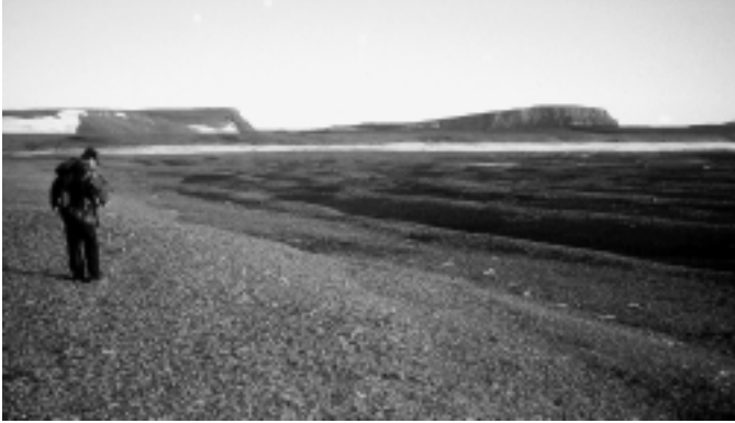
FIG. 8. Beach ridges ~5 m asl and escarpment at Cape Varnek, the most probable location of Barents' and Andriesz' grave.

Andriesz were buried on the beach of Cape Varnek, but this grave was destroyed during storm surges.