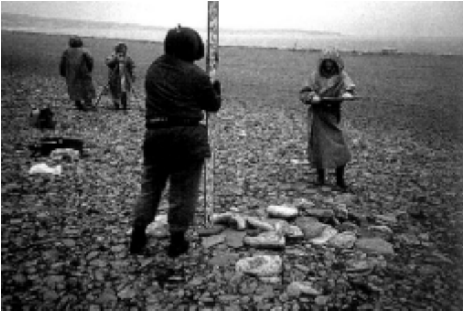
FIG. 6. Archaeological survey of a potential rock-pile grave (Site #3) on the beach of Ivanov Bay. The structure in the background is a shelter erected by 1995 expedition (repaired and enforced in 1998).

this cairn may have supported a pole or a cross for navigational purposes (Salikov, 1997).