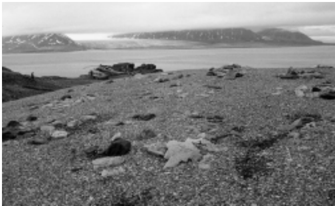
FIG. 2. Whaler graves at Bellsund, east coast of Recherchefjorden, southwest Spitsbergen, on a raised beach 18–20 m asl. Beach construction of pebbles and gravel is similar to that of beaches on north Novaya Zemlya.