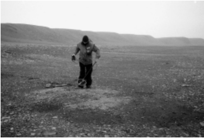
FIG. 4. Inspection with a metal detector of a moss growth in Inostrantsev Bay. Novaya Zemlya is a nutrient-deficient arctic desert and moss is a good indicator of bone material, a source of phosphates. A grave, therefore, may be recognized from large moss growths.

fortunate gale. Thus, the historical data indicate that a German mile equals 6.3 km, but the measurement of a mile along the Novaya Zemlya coast may be off by as much as 3 km.