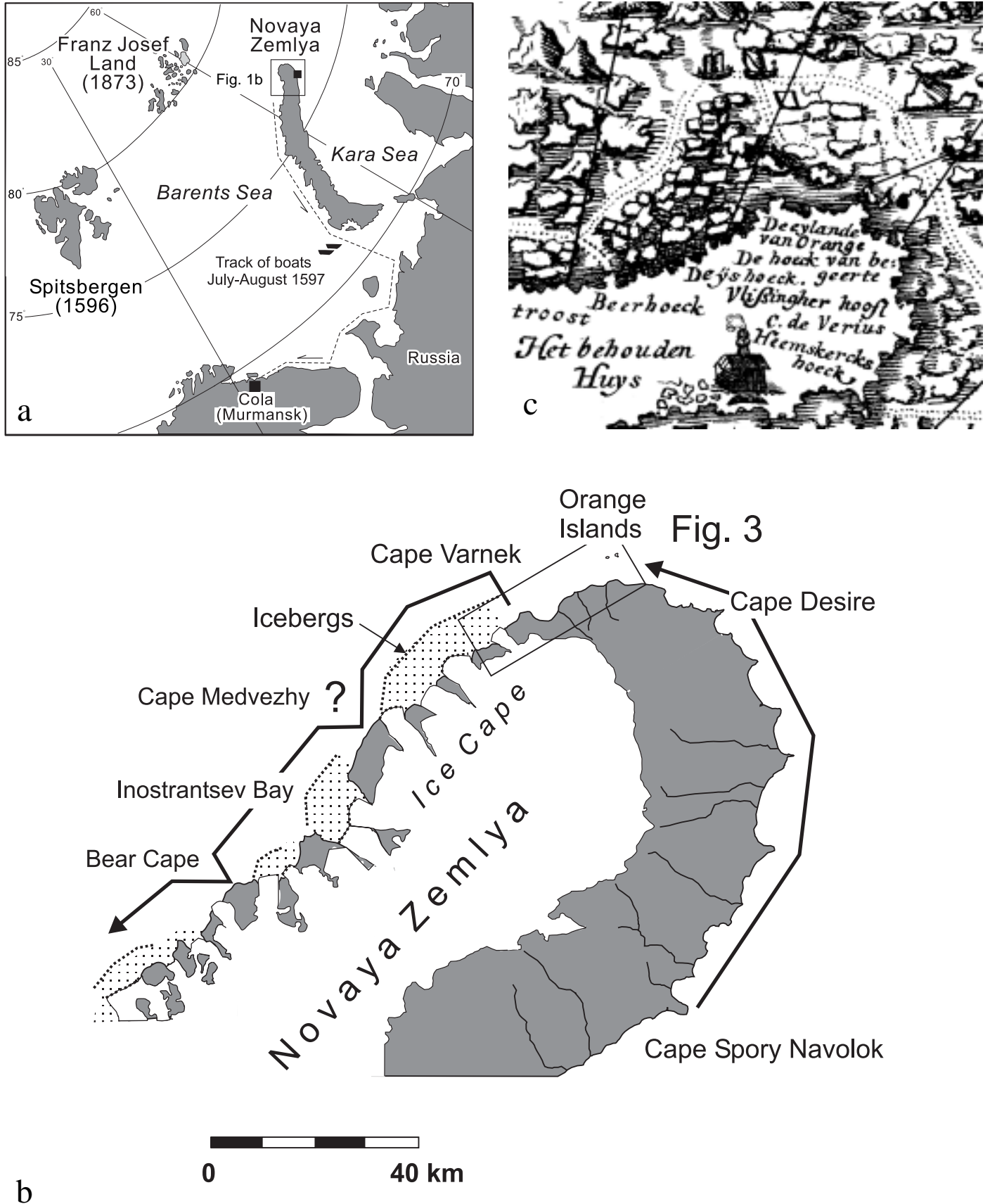
FIG. 1. (a) Location of northernmost Novaya Zemlya. (b) Location of sites discussed in text. (c) Inset of Barents' map from De Veer (1598): The increased density of sea ice near the north cape of Novaya Zemlya may reflect iceberg calving. The track plotted on this map suggests that the Dutch maneuvered around the iceberg area before they continued along the coast.