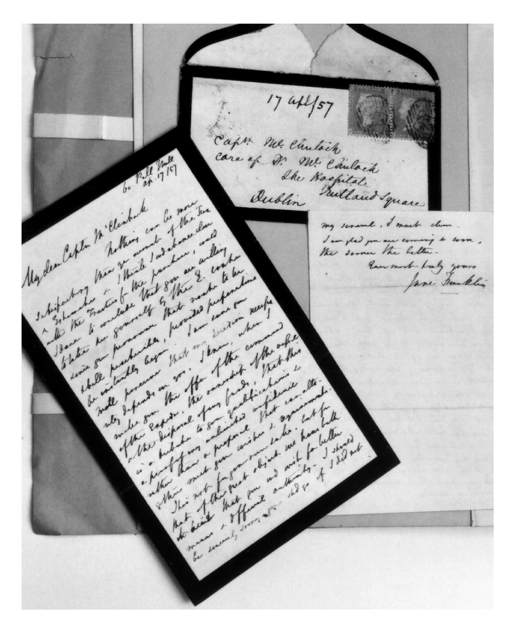
FIG. 2. A portion of Lady Franklin's letter of 17 April 1857, giving Captain M'Clintock command of the Fox , and related envelope (Franklin and Cracroft, 1857–1871).

accept. Researchers can draw some solace from the penultimate sentence, which indicates that Lady Franklin was at least aware of her challenging handwriting! This letter had an interesting history (Fig. 2). The envelope, postmarked AP 18 1857 and docketed by M'Clintock "Offer of command of Lady F's Expn.," survives. This document formed the foundation of a collection of letters, apparently assembled by M'Clintock, in what might be termed the "M'Clintock Portfolio" (Franklin and Cracroft, 1857–1871). M'Clintock referred to this letter at the outset of his hugely popular book on the expedition: "On the 18th April, 1857, Lady Franklin did me the honour to offer me the command of the proposed expedition – it was of course most cheerfully accepted" (M'Clintock, 1859:4).