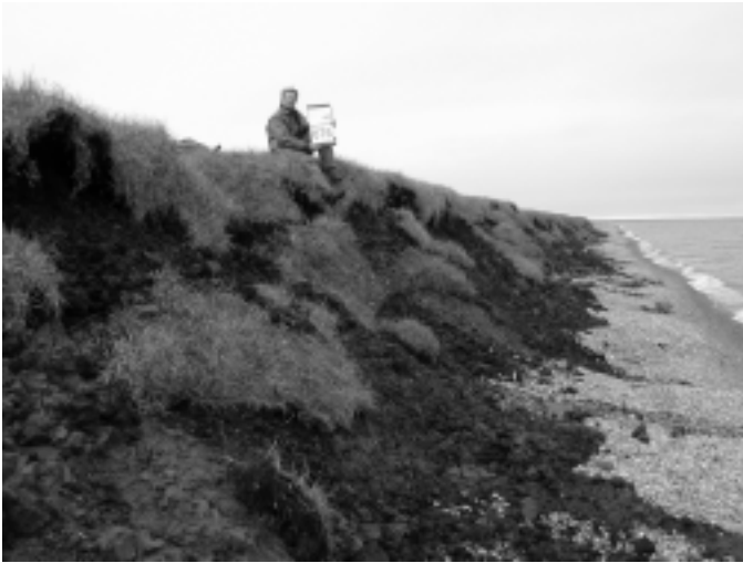
FIG. 3. Polar bear maternal den site on active coastal bank in Arctic National Wildlife Refuge, Alaska, 31 July 2001.

average height of 62 cm and width of 87 cm. Harington (1968) reported a tunnel height of 56 cm and width of 59 cm. Den tunnels in Svalbard ranged from 70 to 100 cm in diameter (Larsen, 1985). Polar bear dens on Wrangel Island (Uspenski and Kistchinski, 1972) had tunnel heights of 50–60 cm and widths of 70–110 cm. These dimensions differed little from the mean tunnel height and width (49 and 126 cm) that we measured at maternal dens. Our observation of digging activity by cubs (in four dens) is also consistent with other reports (Harington, 1968; Lentfer and Hensel, 1980; Hansson and Thomassen, 1983).