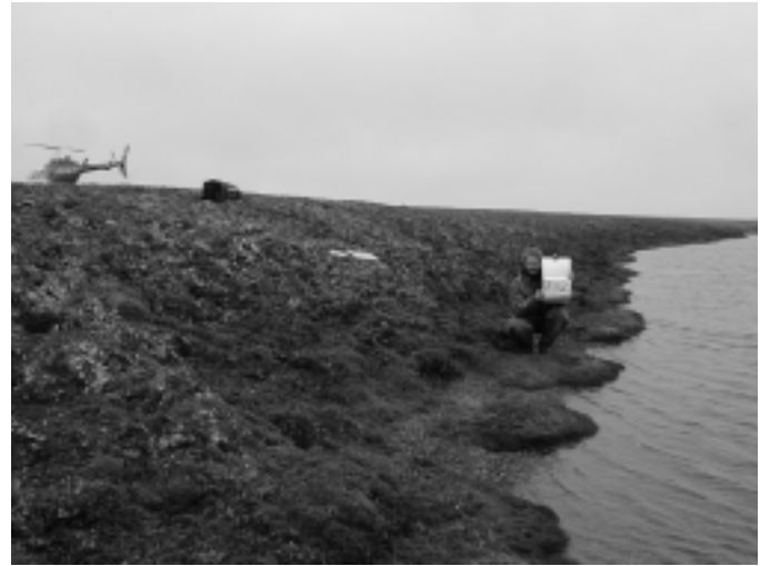
FIG. 4. Polar bear den site on stable lake shore near Prudhoe Bay, Alaska, 30 July 2001.

The presence of “ventilation holes” in polar bear dens has been observed in several regions of the Arctic (Harington, 1968; Uspenski and Kistchinski, 1972; Lentfer and Hensel, 1980). During FLIR surveys in January and November 2001, we noted small openings in the roofs of five dens. These openings could have served a ventilation function and were of a size that a female bear could have created by using her paws to scrape a hole in the ceiling of the den. The openings also could have resulted from accidental collapse of the roof due to digging by bears to enlarge the den. The holes observed over two dens seen in January were not there when the dens were first discovered. They remained open for a few days, and then apparently drifted closed. These openings appear similar to those described in two maternal dens by Lentfer and Hensel (1980). Bears may occasionally create small temporary openings in their dens, perhaps for thermoregulation and air transport (Lentfer and Hensel, 1980), but our observations suggest that they do not continuously maintain them. It is not clear to us what mechanism may have resulted in the long, narrow ventilation holes described by Harington (1968), and how it would be possible for bears to maintain them. Ventilation holes were not observed in polar bear maternal dens in Svalbard (Hansson and Thomassen, 1983). While small openings in the den may facilitate gas exchange and thermoregulation, the low