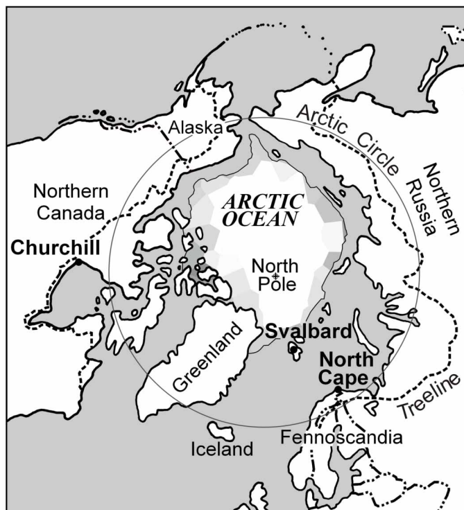
FIG. 2. Map of the Arctic, showing the location of three main visitor destinations: Churchill, Svalbard, and North Cape.