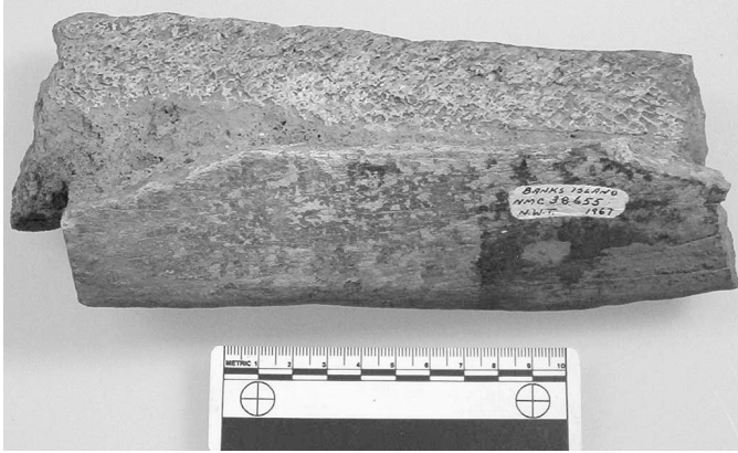
FIG. 3. Left tibia shaft (CMN 38655) of a mammoth from the Ballast Brook area, northwestern Banks Island, Northwest Territories. It yielded a radiocarbon age of 20\,700 \pm 270 BP (T0-2355, normalized).

18000 BP (Dyke and Prest, 1986). If the animals had reached these areas several thousand years earlier, perhaps aprons of vegetated sediment in front of the advancing Laurentide ice might have made travel across these zones easier, particularly in the shallower depression between Beaufortia and Banks Island. A possible analogue is the crossing—by mammoths ( Mammuthus sp.), American mastodons ( Mammuth americanum ), helmeted muskoxen ( Bootherium bombifrons ), bison ( Bison sp.) and other mammals—of large vegetated floodplains that evidently filled the Strait of Georgia about 30000 to 20000 BP in front of southerly moving glacial ice (Harington, 1975, 1996). Further, mammoths could have crossed sea ice, if it was thick enough. An added inducement to cross ice could have been the scent of distant vegetation carried on winds from the northeast. Tundra muskoxen are known to travel between various Canadian Arctic Islands across frozen sea ice at present (Miller et al., 1977).