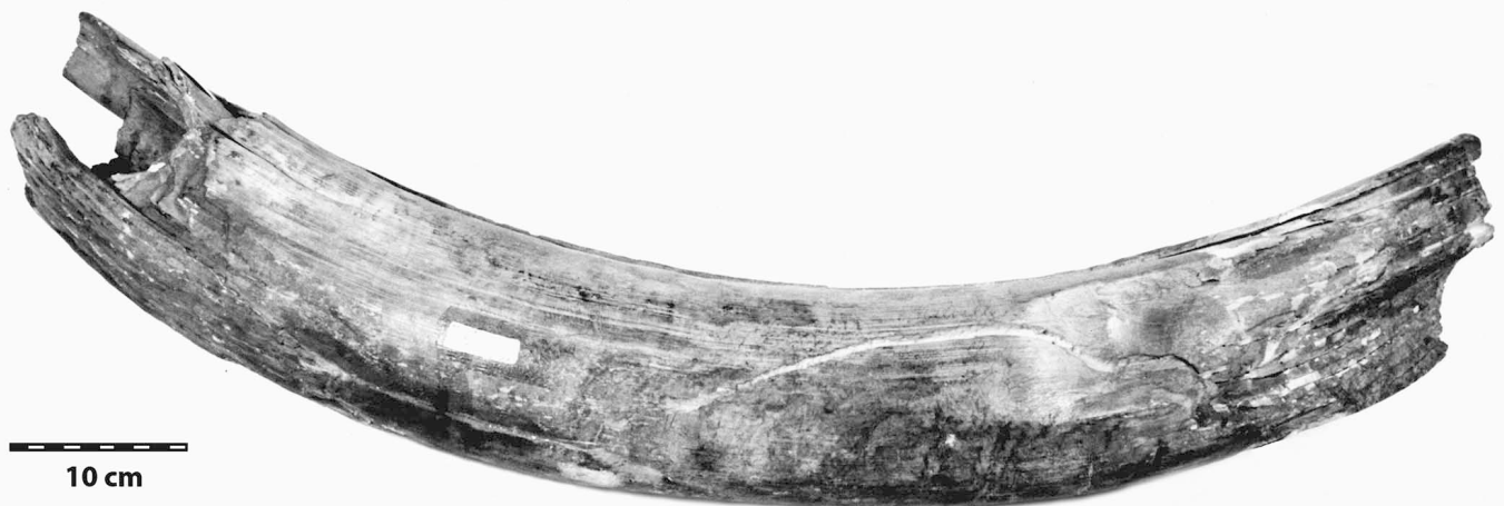
FIG. 4. Partial tusk of a mammoth (CMN 11833) from near Cape James Ross, Melville Island, Northwest Territories. It yielded radiocarbon ages of 21\,000 \pm 320 BP (GSC-1760) and 21\,600 \pm 230 BP (GSC-1760-2). It is the northernmost record of mammoths in North America.