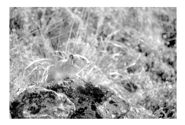
A collared pika (Ochotona collaris) with white ear tag for identification.

I am using a combination of descriptive and experimental methodologies, combined with modelling techniques, to increase our understanding of plant-herbivore interactions and their influence on herbivore population dynamics, using the collared pika ( Ochotona collaris ) as a model species. Pikas are small (~160 g) lagomorphs that live in alpine talus slopes. Pikas are asocial and each individual collects vegetation for two distinct diets: a summer diet that is consumed immediately, and a winter diet that is stored in haypiles under boulders (Millar and Zwickel, 1972; Conner, 1983). Because of predation risk, pikas rarely venture more than 10 m from talus into meadows to collect vegetation (Holmes, 1991), and this behaviour creates a strong gradient of grazing pressure, with most