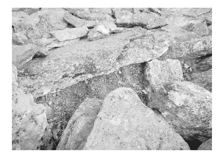
Pikas spend many hours collecting and storing vegetation to eat during winter.

metabolism, and mortality components to model pika and vegetation biomass. Further, it allows for the integration of foraging behaviour into population dynamics while accounting for variation in habitat quality as a consequence of climate variability and change.