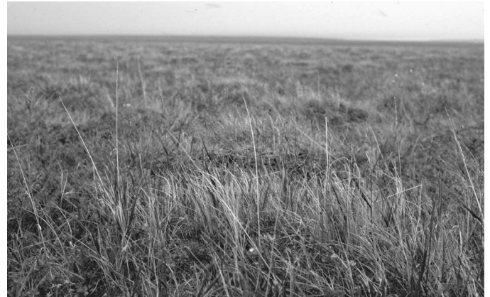
FIG. 2. Grass-rich tundra near the mouth of the Kolyma River (69°28' N, 161°46' E), in northern Sakha (Yakutia). The prominent grass is Arctagrostis latifolia . This area has silty soils over ice-rich permafrost (Smith et al., 1995) and average annual precipitation of just 20 cm (Matveev, 1989).

The diversity of potential Pleistocene lowland grasses is perhaps surprising in view of the overall paucity of grass-dominated vegetation in the study area today. There are multiple species adapted to moist-mesic conditions ( Alopecurus alpinus , Arctagrostis latifolia , Calamagrostis canadensis , Deschampsia cespitosa , Poa arctica ) and dry