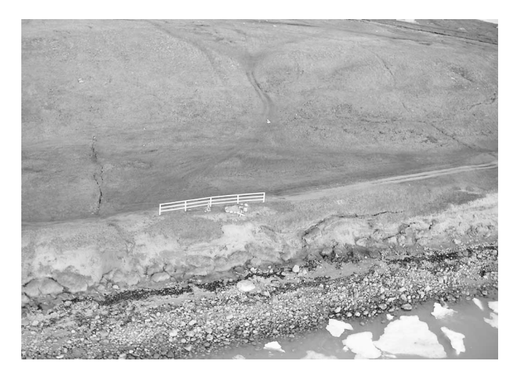
FIG. 2. Aerial view of gravesite in 2004, showing state of shoreline erosion.