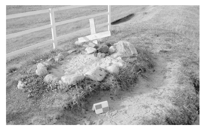
FIG. 4. Grave of Hector Pitchforth prior to excavation.

In 2004, responding to a request from the community, and with the permission of relatives of the deceased, the Government of Nunavut undertook the exhumation of the remains and their reburial in a location where the impacts from human activity would be reduced and the threat from erosion eliminated. The work was conducted under the Nunavut Archaeology Program, established in 2002 by the Department of Culture, Language, Elders and Youth (CLEY) as a means to help communities manage, investigate, and protect archaeological resources. Under this program, the department has conducted projects in eight Nunavut communities, including site inspections, development impact assessments, community site surveys, and full-scale excavations. This project was the first exhumation and reburial under the program. The provision of archaeological training and employment opportunities for Inuit is a key component of the Nunavut Archaeology Program, and in 2006 a multiyear archaeology field training program commenced in partnership with the Inuit Heritage Trust.