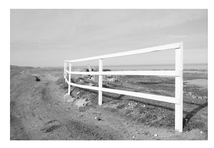
FIG. 1. Fence erected by community volunteers along allterrain vehicle trail to protect the Janes and Pitchforth gravesite near Mittimatalik (Pond Inlet).

The level of human activity in the vicinity of the graves, combined with the fact that they are shallow and dug into fine sand, has made them susceptible to damage arising from cultural and natural activities. Over time, the rocks and sand covering the Pitchforth grave were removed, and damage to the coffin lid exposed the contents to the elements and to the curious-minded. The grave markers had also fallen (or been removed), and for a brief period, they