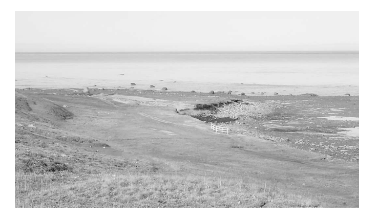
FIG. 3. View of site selected for reburial (flat area in foreground). The existing gravesite can be seen in the distance.

but did not act on the idea of moving the graves (P. Ootoowak, pers. comm. 2005).