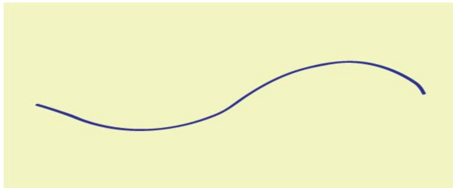
Fig nr. 1 The sigmoid curve; Source: Handy C. – The Empty Raincoat , Codecs, Bucharest, 2007

If you think you know the way to the future since it is only a continuation of the one reached so far, you might as well get to another place. The sigmoid curve (fig. nr. 1) is an S-type curve, which has been a problem since ancient times.