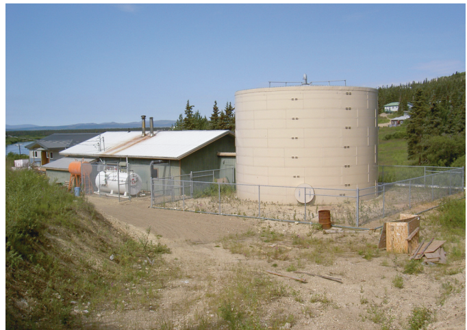
FIG. 3. Water tank in White Mountain, Alaska.

In White Mountain, a well was drilled as early as 1964, followed by another well in 1968. By 1986, a piped water delivery system was installed, and upgrades have occurred continuously since then. The well currently in use was drilled in 1968 and is 129 feet deep. Information provided by community members in 2004 indicates that the original well, drilled in 1964 to a depth of 118 feet, was contaminated with oil. The newer well, 400 feet up a hill from the original 1964 well location, is pumped continuously at 24 gallons per minute to meet demand and keep a 150 000-gallon storage tank full. Major upgrades were made around 1981, including a new water plant and tank, with pipes following within a few years (Fig. 3). When the 1981 water plant was installed, the design population was 250 people, with a per capita use of 15 gallons per day. The distribution system has one loop serving the town, and continuous pumping prevents freezing. The water system and washeteria are operated by the municipal government. Water is filtered, chlorinated, and fluoridated (ADCCED, 2004a; authors' field notes). Piped