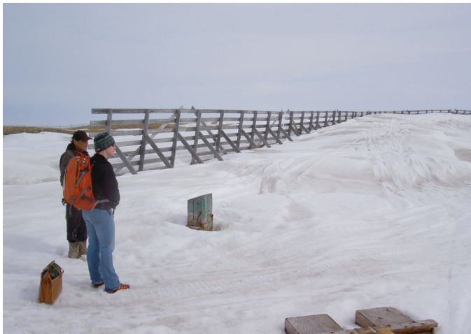
FIG. 2. The lined water catchment of Shishmaref, Alaska, surrounded by a fence. An engineering graduate student and a Shishmaref resident are surveying the outer area of the community's potential water supply.

Shishmaref's central water system is operated by the municipal government. The water system consists of raw water collection, water treatment, a washeteria, a central watering point, and water delivery by vehicle. The washeteria, an important central location in many villages, is the building that houses the water treatment plant, as well as public showers, toilets, and washing machines. Raw water to supply the system comes from a surface water source and is filtered and chlorinated (ADCCED, 2004b). Shishmaref's surface source is a lined catchment area, on one side of which snow fences were built to enhance snow catch (Fig. 2). Snowmelt is then retained at the surface for use. Treated water is stored in a 300 000 gallon tank. A project in progress is installing household plumbing and a flush/haul system. Those households with tanks installed can have water delivered, and others can haul water from the watering point at the washeteria. Waste is deposited in sewage lagoons via sewer pipes (several public buildings), honey bucket haul, or flush tank haul.