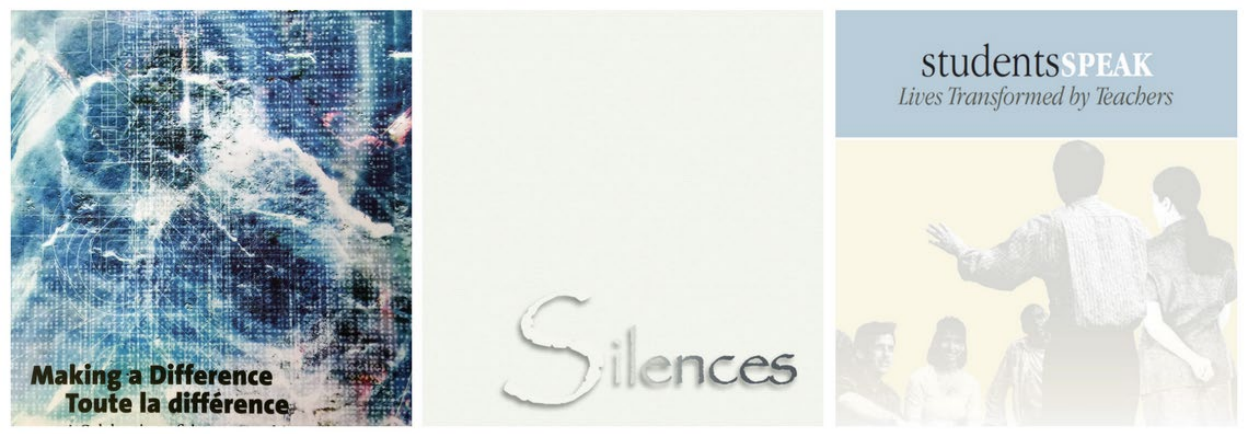
Figure 2. Covers of the 3M Council's three book publications: Making a Difference (left), Silences (center), and Students Speak (right)

Over the years, the 3M Council assumed a role that was central to the broader impact of the fellowship program through the development of several national initiatives to advance teaching and learning in higher education. These included three book publications with contributions from nearly 100 fellows (Figure 2), the Scholarship of Leadership in Education grant to fund collaborative educational leadership initiatives by 3M fellows, a speakers list of 32 fellows, the aforementioned Postcard project to commemorate the meaning of the fellowship on its 25th anniversary, and several key partnerships with a number of external organizations. For example, the fellowship program's partnership with Maclean's magazine was seen as the most influential partnership in that it brought "national prominence to excellence in teaching and educational leadership."