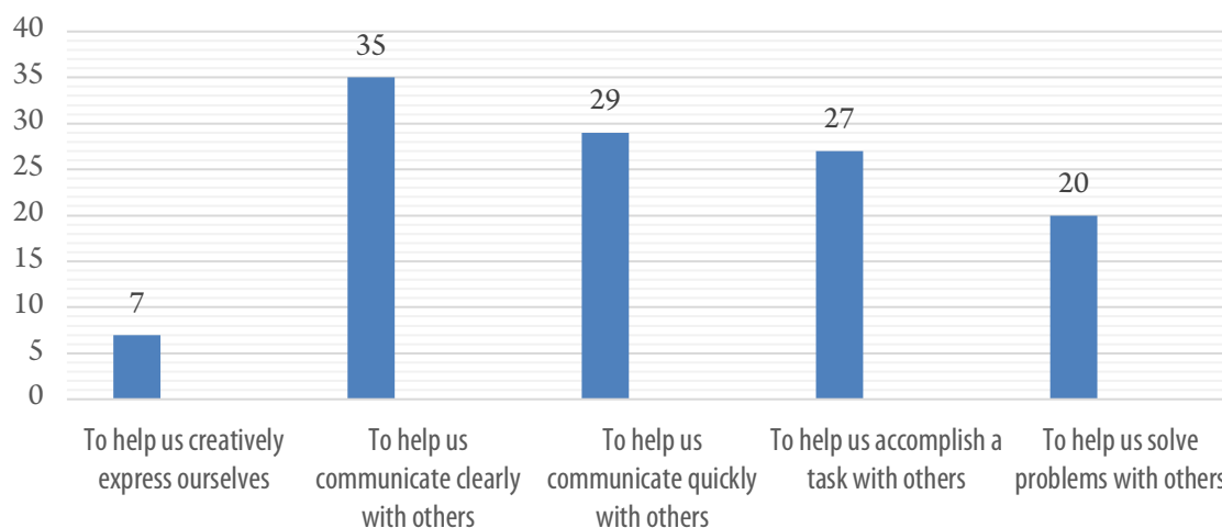
Figure 1. Responses of 38 first-year cadets very likely to commission regarding why MILS instructors teach writing.

Continuing with these two filters in place, the next figure reports on question 11 in the survey: “What do you think writing does? Select all that apply”.