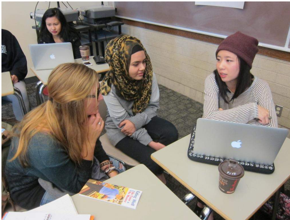
Figure 2. Second-year education students' peer mentoring first-year students

In the first-year course, the students have journal and portfolio checkpoints throughout the semester. The second-year students provided weekly online journal and portfolio support, and once a month they had face-to-face classroom meetings with the first-year students. Each of these face-to-face meetings took place in advance of a journal or portfolio checkpoint so that the first-year students could receive their mentoring feedback in person before submitting their work to the course instructor. The peer feedback was formative in nature (e.g., prompts for greater clarity and depth of understanding), while the course instructor feedback was summative (e.g., formal grade). There were 53 second year and 88 first-year education students involved in this phase of the research study.