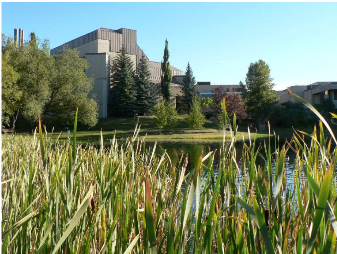
Figure 1. Mount Royal University, Calgary, Alberta, Canada