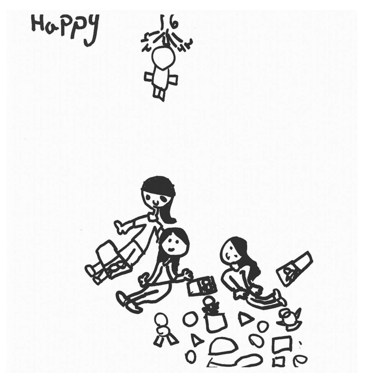
Figure 3. Collaborative nature of classroom mathematics depicted by a Grade 1 student

Some of the drawings early years students depicted communicated the collaborative nature of classroom mathematics learning (Figure 3). This is interesting because this kind of picture