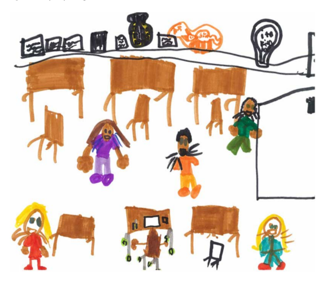
Figure 2. Noisy classroom depicted by a Grade 1 student