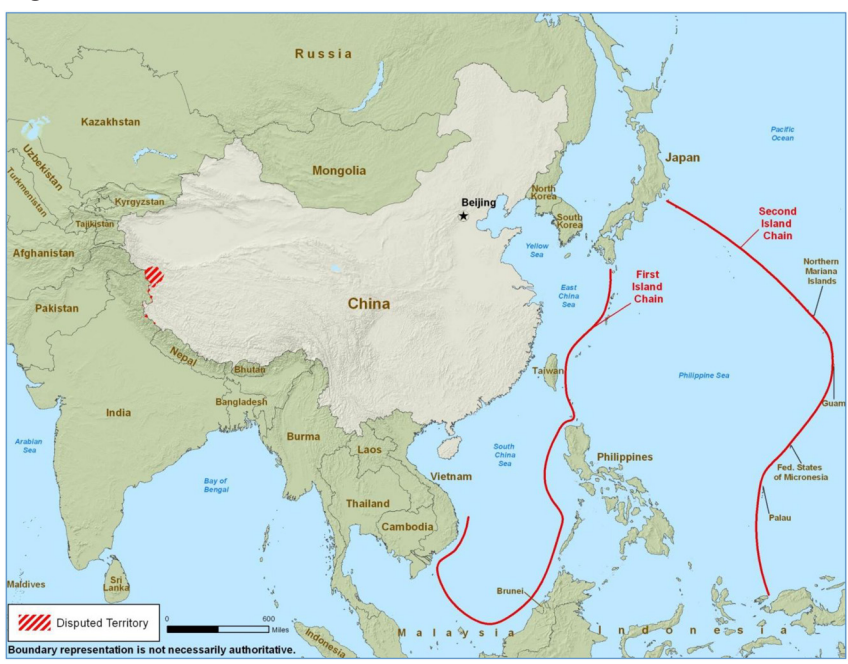
Figure 1: The First and Second Island Chain

relevant in buttressing the American position in the Asia-Pacific. After all, in this quintessentially maritime theatre of operations, "US involvement in large-scale land warfare anywhere in East Asia other than Korea is especially improbable." Instead, the central challenge is posed by China's growing capacity to contest (if not command) the maritime and aerospace domains of the Western Pacific—from the "first island chain" that stretches from Japan's Ryukyu Islands to Taiwan and the Philippines, which encompasses the Yellow, East, and South China Seas, and potentially into the "second island chain" that goes from Japan's eastern coast to Guam, Palau and then surrounding the Philippines Sea (see Figure 1). To maintain its "command of the commons," the United States needs to focus on its air and naval assets rather than ground forces—with the important exception being the continued presence of forward-deployed US Marines, which in any event would rely heavily on maritime sealift to reinforce America's military presence on the Korean Peninsula.<sup>69</sup>