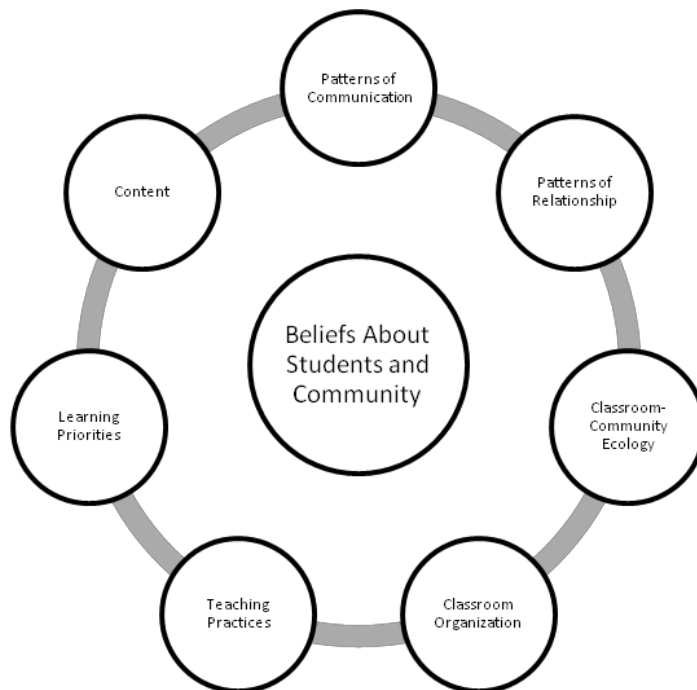
Figure 1. Pedagogical Framework for Informing Culturally Responsive Teaching

Because the purpose of this research was to identify what participants identified as influences upon their learning, and characteristics of effective teachers, both informal and formal, we organized the themes from our data around independently identified and then negotiated and agreed upon headings. In all, we identified eight categories of thought and practice that were indicators of effective practice, all of which were influenced by teacher's beliefs about students and the community students represented. These are illustrated in Figure 1 and 33 of these practices are organized in Appendix A in what we refer to as a Classroom Teaching Inventory. What provides significant credibility to these behaviors identified by