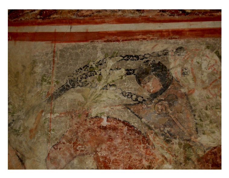
Fig. 3 Treviso, Museum of Santa Caterina, Otinel fresco, detail: Otinel's weapons