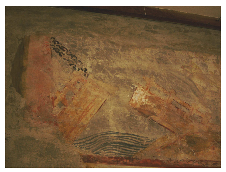
Fig. 5 Treviso, Museum of Santa Caterina, Otinel fresco: drawbridge

and Roland happened between the Marne and the Seine. According to Rita Lejeune it is more likely to have been the Seine, because the text also speaks of a monastery of Saint Mary, that is Notre Dame. The city represented in the fresco is thus likely to be Paris, which overlooks the Seine: it is there that Otinel went to see Charlemagne. The duel between Ferragu and Roland does not include a castle in the background and does not take place in Paris, but happens in an open plain.