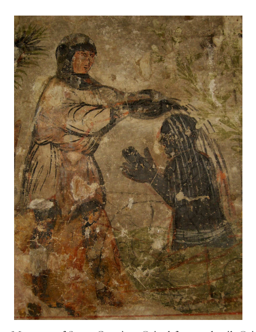
Fig. 4 Treviso, Museum of Santa Caterina, Otinel fresco, detail: Otinel's baptism

The same weapon is represented in a miniature of the manuscript of the Entrée d'Espagne in the Marciana<sup>6</sup>. However, the giant's size and this detail are the only two elements that allow to think that the fresco represents Ferragu. Other details in the fresco, in fact, reveal a different character, above all one scene representing a baptism [fig. 4]. In the Entrée d'Espagne, Ferragu was not baptised but instead died at Roland's hand.