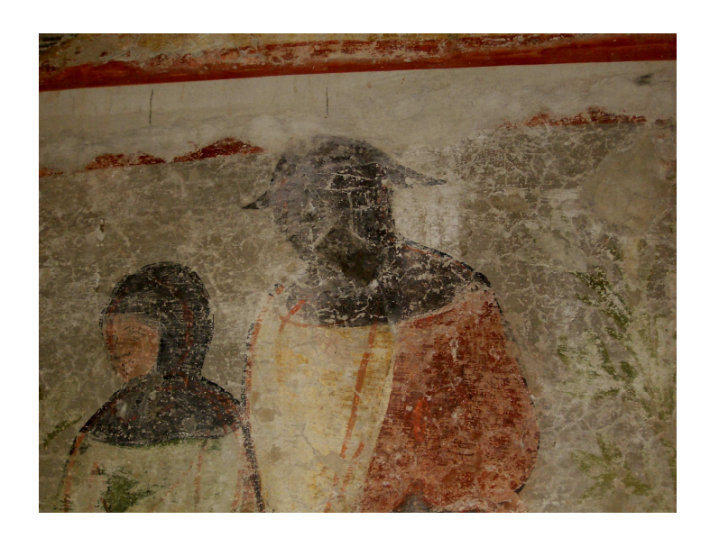
Fig. 2 Treviso, Museum of Santa Caterina, Otinel fresco, detail: Roland and Otinel