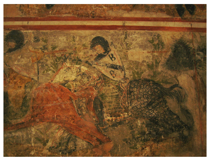
Fig. 6 Treviso, Museum of Santa Caterina, Otinel fresco, detail: a knight holds a shield with two Bs

However, on the upper left side of the shield it is still possible to distinguish a white dove, the symbol of the Holy Spirit, which lands on Otinel in all versions of the legend and anticipates that Otinel will eventually convert and be baptised.<sup>8</sup> As discussed by Dante Bianchi, the presence of the dove indicates that the source for this scene is the Chanson d'Otinel and not the version of Jacopo d'Acqui<sup>9</sup>.