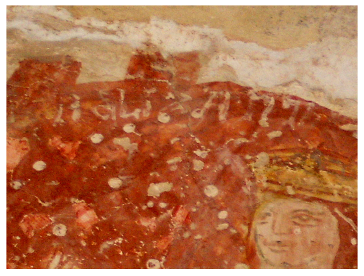
Fig. 8 Sesto al Reghena, Abbey of Santa Maria in Sylvis, detail: Belixant

This scene represents two figures sitting on a throne. One is a female figure and her name can be read beside her head, where a writing reveals to us that she is Belissant (BELIXANT) [fig. 8], Otinel's bethroted who the Saracen was allowed to marry only after being baptised.