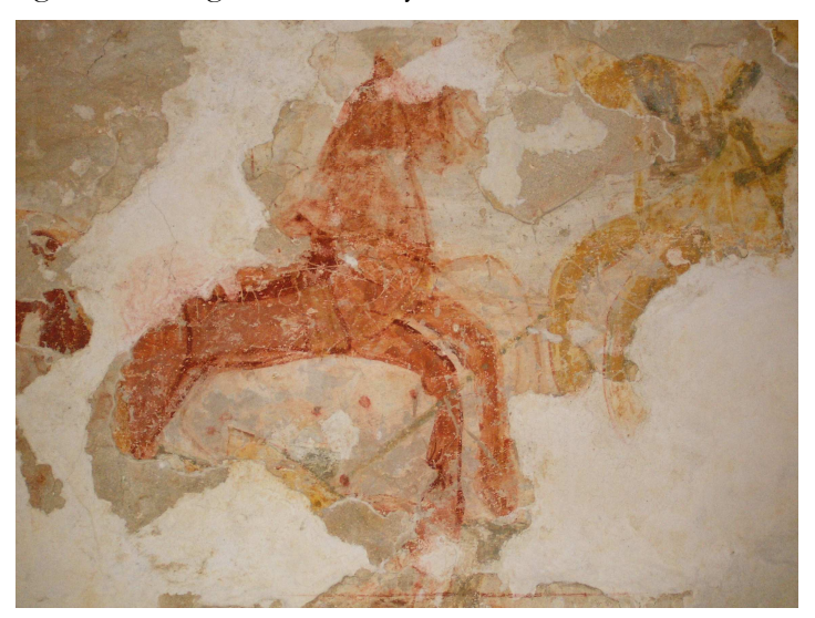
Fig. 10 Sesto al Reghena, Abbey of Santa Maria in Sylvis, detail: clashes between Christian and Saracens soldiers

and romance contributed to the creation of a mythology of chivalry as the defender of both society and Christendom – could take place in either a lord's palace or in a monastery. The purpose was, in fact, the same: to endow the newly born lordships with the right to identify themselves with the characters and to feel legitimated to govern in everyone's best interest.