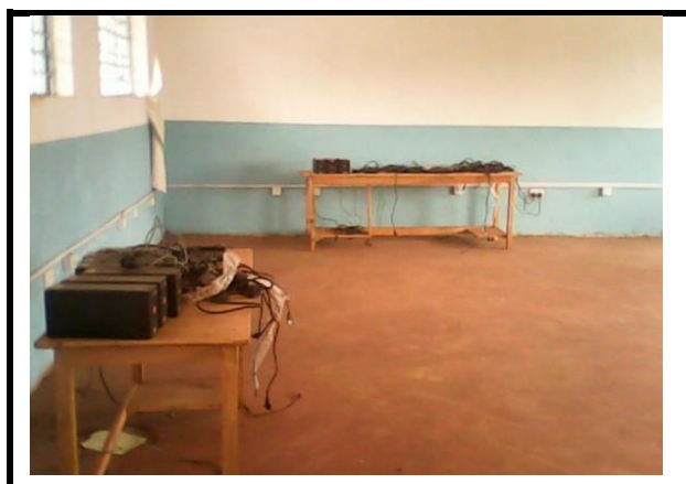
Photograph 4.2: A photograph showing a vandalized computer lab

On the other hand, on observation, some computer labs in some schools had been vandalized as shown in Photograph 4.2.