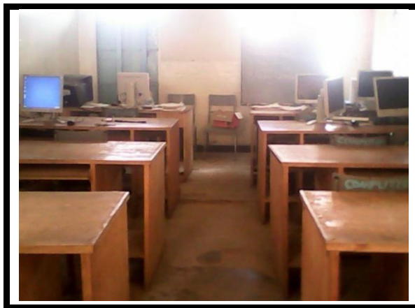
Photograph 4.1: A Photograph showing a computer lab

In most schools, since the computer labs could not handle large groups of learners, due to limited number of computers, only the students who were taking Computer Studies as an optional subject were allowed into the computer labs to do their projects. These results are in tandem with those of a study by Kirimi (2012) in Kangema and Migwi's (2009) who found that majority of schools had computers but they were inadequate for efficient teaching by the teachers. The desktop computers would be instrumental in simulations, which are activity based, where the learners do activities and see the results but if the learners cannot access the desktops, then it is difficult to use such simulations, which are key in student-centered approach, simplifying abstract content and at the same time creating interest in the learners of Physics.