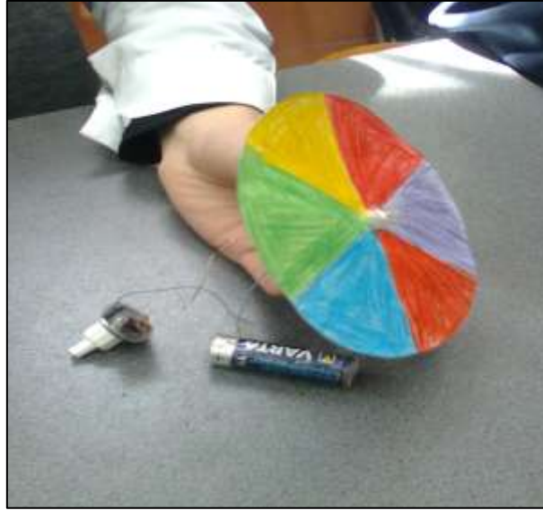
Figure 4: Color wheel