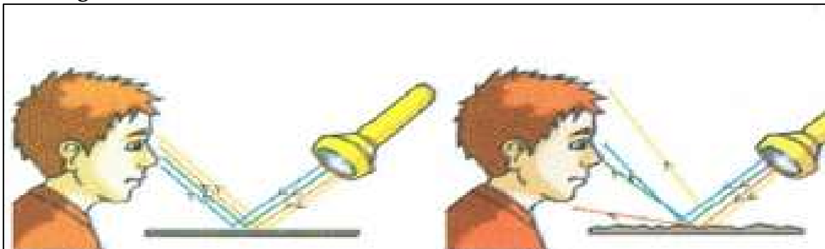
Figure 2: Reflection