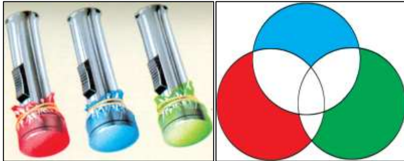
Figure 3: Combine the colors