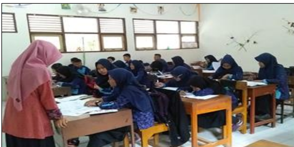
Figure 6: Learning Process of Control Class

Based on learning process Figure 5 experiment class and Figure 6 control class to trained of thinking metacognition ability. Post-test results on the question of evaluation for the Metacognition ability on the class of the control class and experiments class shown that the learners were able to understand the material chemical rate learning through stages of problem post-test done. But from the results of a post-tests wants to grade steeper than the grade control due to the influence of the Android media developed in the experimental class, this means that the ability of Metacognition