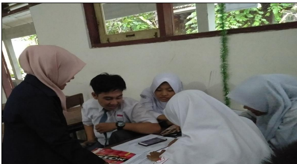
Figure 5: Learning Process of Experiment Class

Learning process of experiment class and control class can be shown in Figure 5 using Android application chemistry learning of reaction rates content and Figure 6 not using Android application learning media.