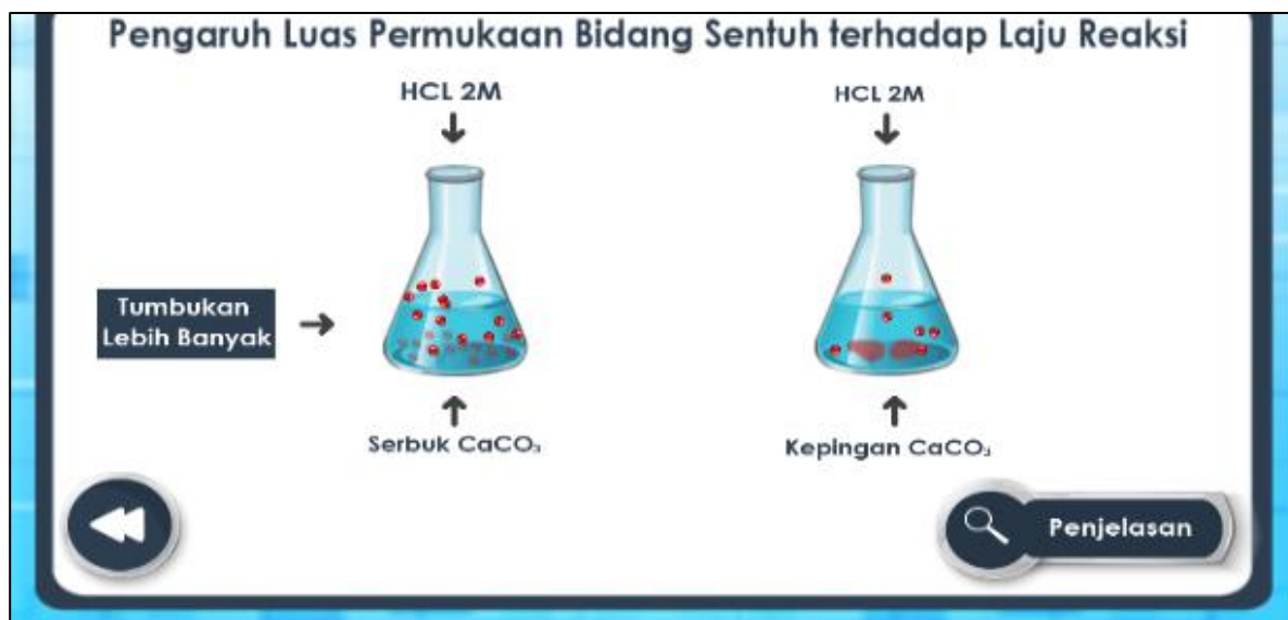
Figure 1: One of the display material reaction rate factor

Android application that was developed to know thinking students with metacognition ability steps starting from the planning of the apperception material associated with everyday life, monitoring visits of material and statements animation of chemical reactions that are in the media the Android application, as well as the evaluation of the ability of thinking trained through practice Metacognition reserved and game problem on Android applications. Example of display media Android applications can be seen in Figure 1 and Figure 2. Android apps for learning media this chemical can be used without using the internet, so it can be used offline if the media is already installed on your Android phone.