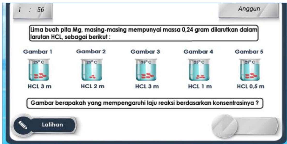
Figure 2: One of the exercises reserved reaction rates