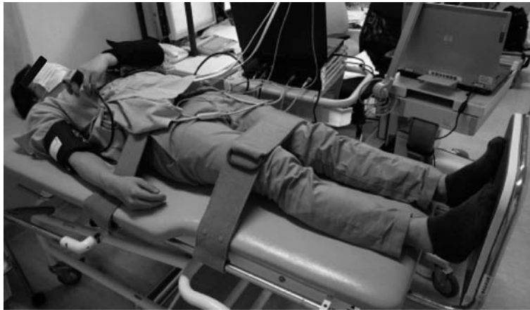
Fig. 1. The test was preceded by 20 min of observation of patients in the supine position. A 70° angle of tilt was used (Figure 1), and the test lasted for a maximum of 70 min with drug loading. Blood pressure was continuously monitored via noninvasive blood pressure measurements.